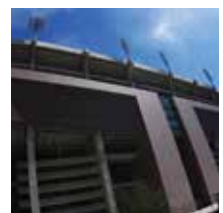
Tiger Stadium Westside Renovation 2005