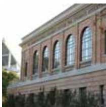
Cox Communications Academic Center for Student-Athletes 2002