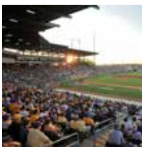
Alex Box Stadium 2009