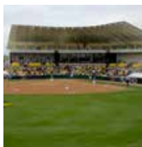
Tiger Softball Park 2009