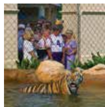
Mike the Tiger's Habitat 2005