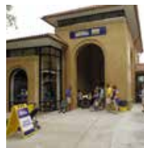
LSU SportShop 2009