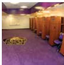
LSU Women's Basketball Facility Renovation 2002