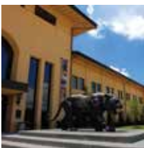
Football Operations Center 2005

A major renovation was completed to the University Club golf course in September 2010, allowing the LSU men's and women's teams to compete on one of the most challenging courses in the country.