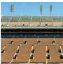
Tiger Stadium Eastside Expansion 2000