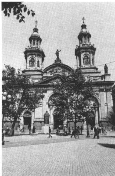
Impressions from the Chilean capital. Old and new merge in the Plaza de Armas where the Santiago Cathedral (small picture right) is reflected in the glass façade of a modern office building (big picture right). Gardens and parks (below) relieve the overall picture of this fascinating city.

In the final between GDR and Italy, two teams with quite opposite styles lined up against each other. On one side, the concept of team play was the dominant idea, and on the other the Latin style. Leading 2-1 at half time, the GDR let the Italians come at them during the second half, and managed a breakaway goal to put the issue of the game beyond doubt.