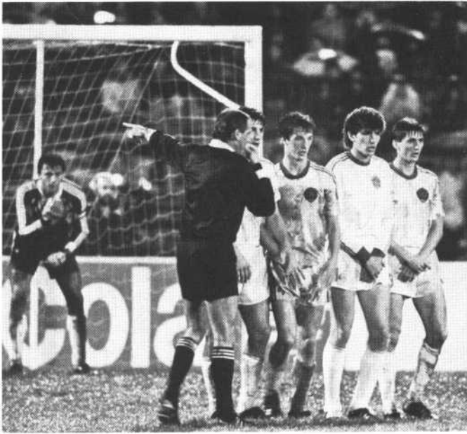
Tense moments before a free kick for the GDR. The players forming the Yugoslavian wall are already computing the possibilities.