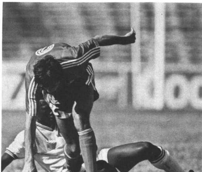
The Bulgarians had tripped a couple of times in the preliminary rounds. The GDR were their final undoing.