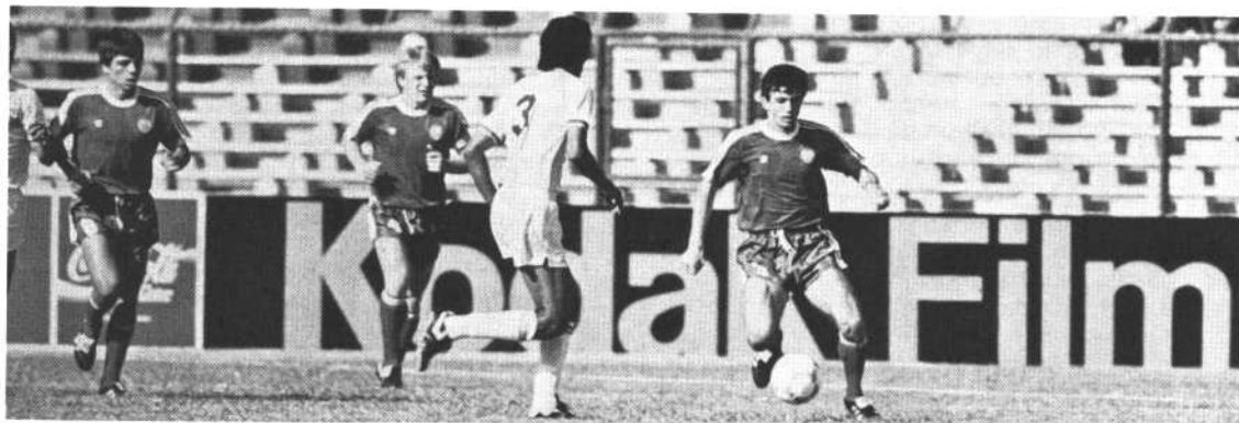
Three Bulgarians versus one Saudi Arabian: this formation was rarely repeated by Bulgaria in the quarter final.