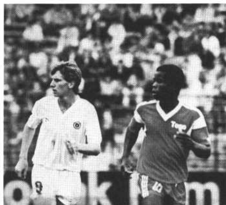
In spite of close marking (here by Koudouwo-voh), Tudor managed two goals in the match against Togo.

Playing once again in a rain-storm, the Yugoslavians turned on a convincing performance against the Australians. The Aussies showed considerable technical potential, but they lacked the means to counter the goal-scoring machinery of their opponents. The 4-0