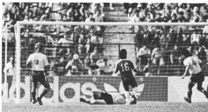
The Chileans narrowly missed scoring a couple of times but could not pull off more than a draw. It was the GDR players who held their nerve in the penalty shoot-out (left).