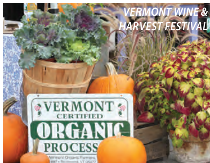
MOUNT SNOW VALLEY CHAMBER OF COMMERCE

Enjoy a Festival preview tasting and the Village Stroll on Friday night, with live entertainment and the Vermont Soup Tasting Contest in Wilmington. Saturday and Sunday discover, savor and enjoy Vermont vintners, small specialty food producers, chefs, painters, publishers, cheesemakers, potters, jewelers, photographers and farmers, all in the Vermont fall foliage at Mount Snow Resort.