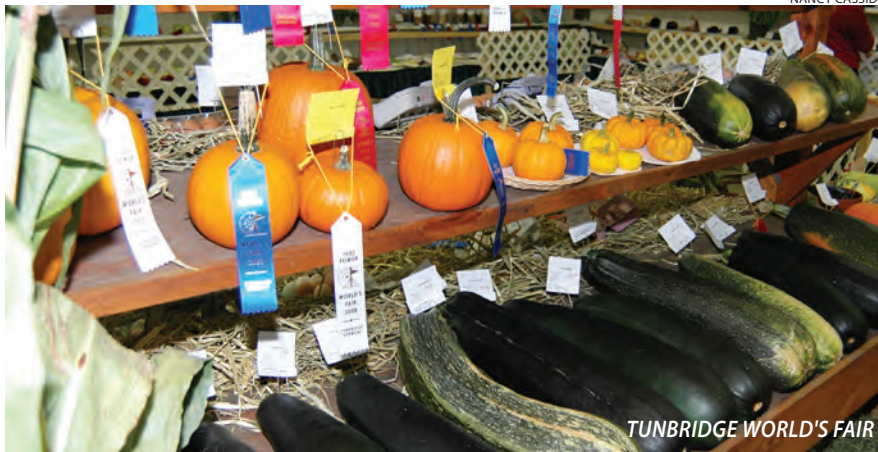
TUNBRIDGE WORLD'S FAIR