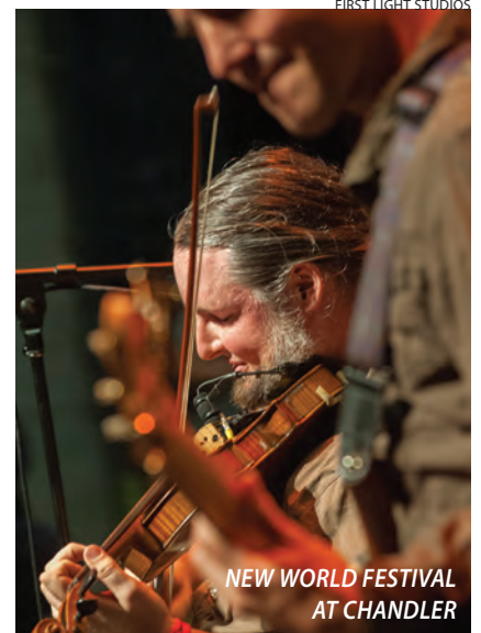
NEW WORLD FESTIVAL AT CHANDLER

Always ten days after Labor Day, the Fair honors agricultural traditions and current farming ideals, such as diversification, organics and sustainability—from harness racing to heritage breeds. The renewal of friendships, tall tales, good music, amusements and “fair food” continue to create a true country fair.