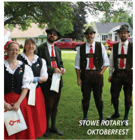
STOWE ROTARY'S OKTOBERFEST