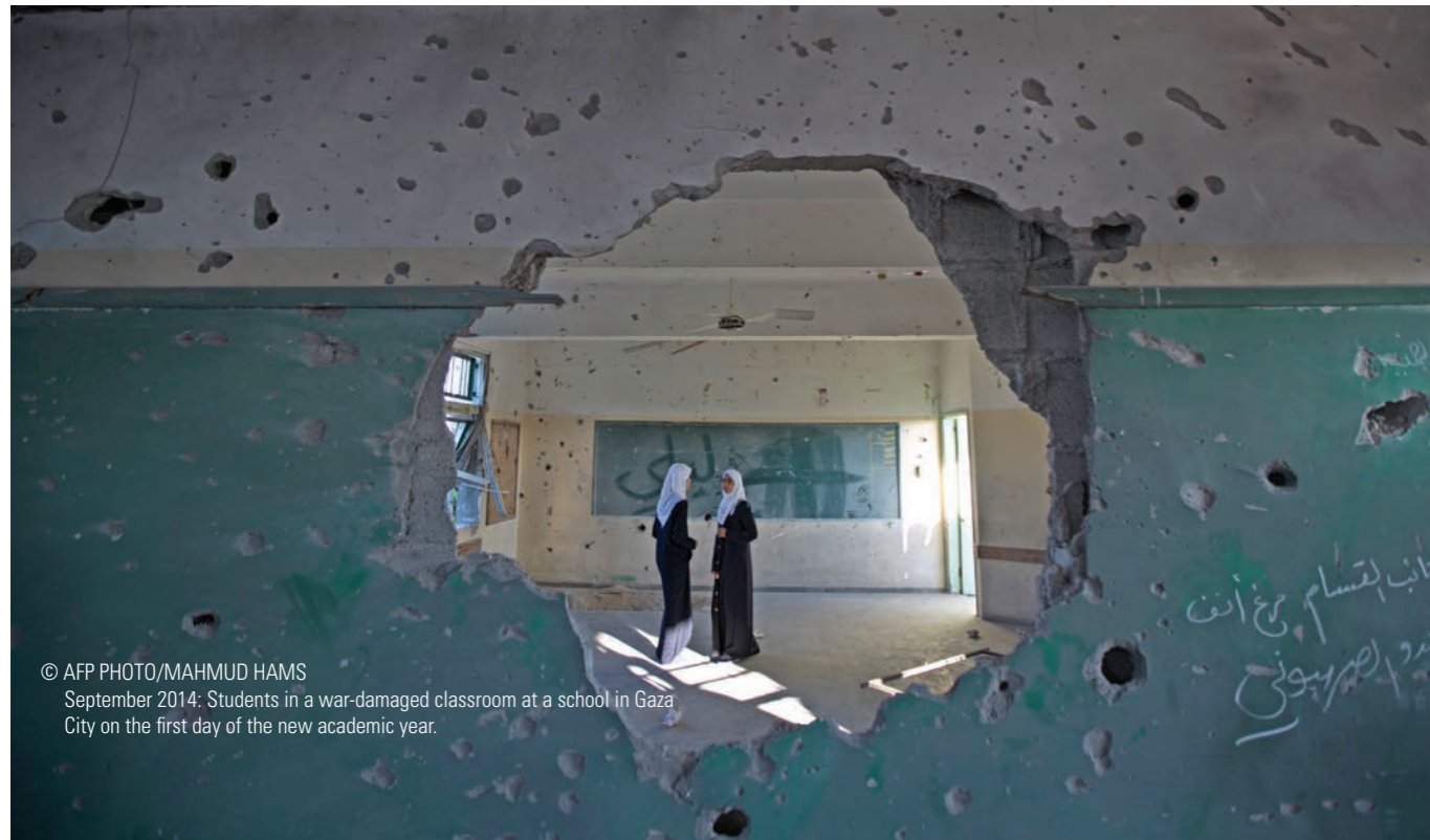
September 2014: Students in a war-damaged classroom at a school in Gaza City on the first day of the new academic year.