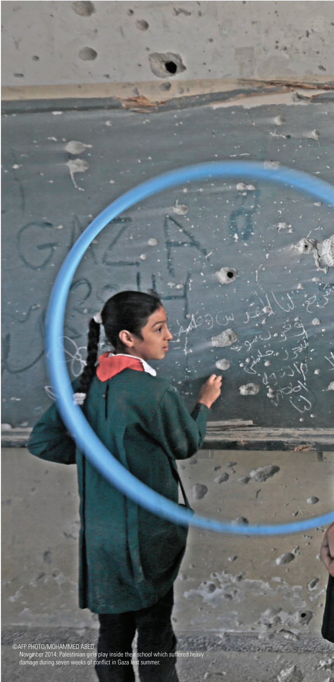
November 2014: Palestinian girls play inside their school which suffered heavy damage during seven weeks of conflict in Gaza last summer.