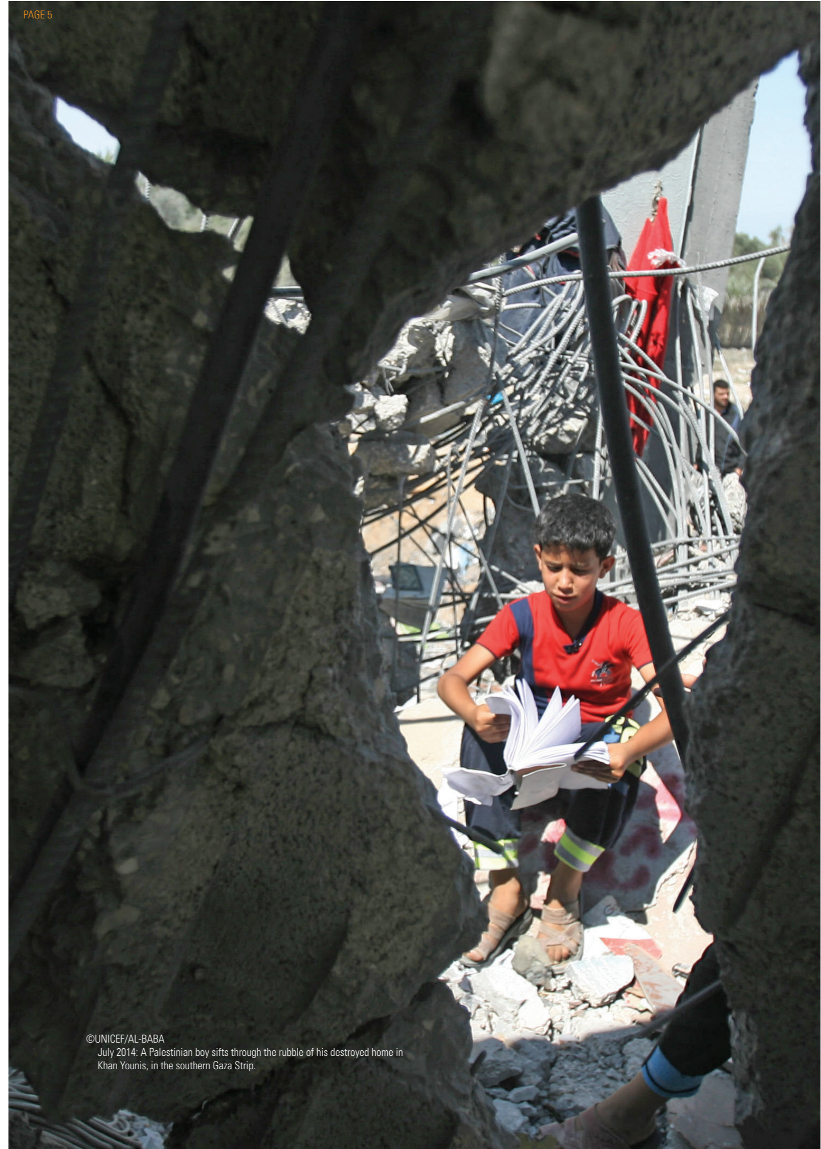
July 2014: A Palestinian boy sifts through the rubble of his destroyed home in Khan Younis, in the southern Gaza Strip.