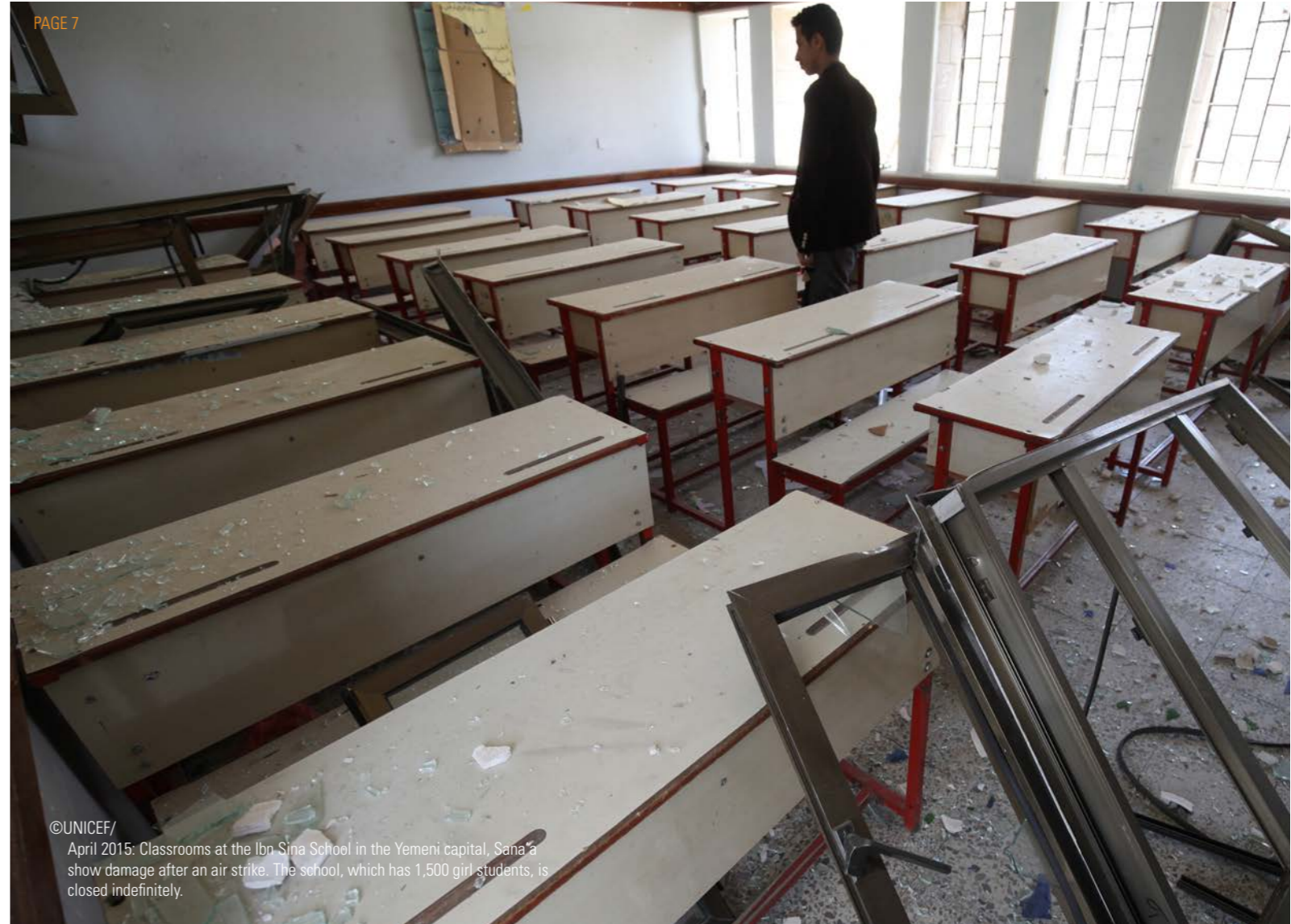
©UNICEF/ April 2015: Classrooms at the Ibn Sina School in the Yemeni capital, Sana'a show damage after an air strike. The school, which has 1,500 girl students, is closed indefinitely.