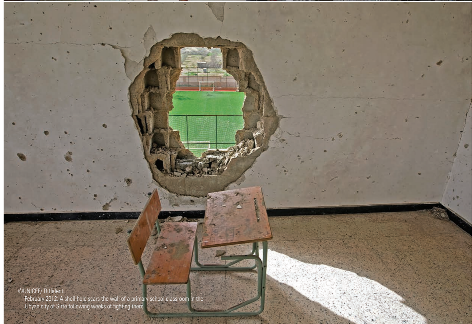
February 2012: A shell hole scars the wall of a primary school classroom in the Libyan city of Sirte following weeks of fighting there.