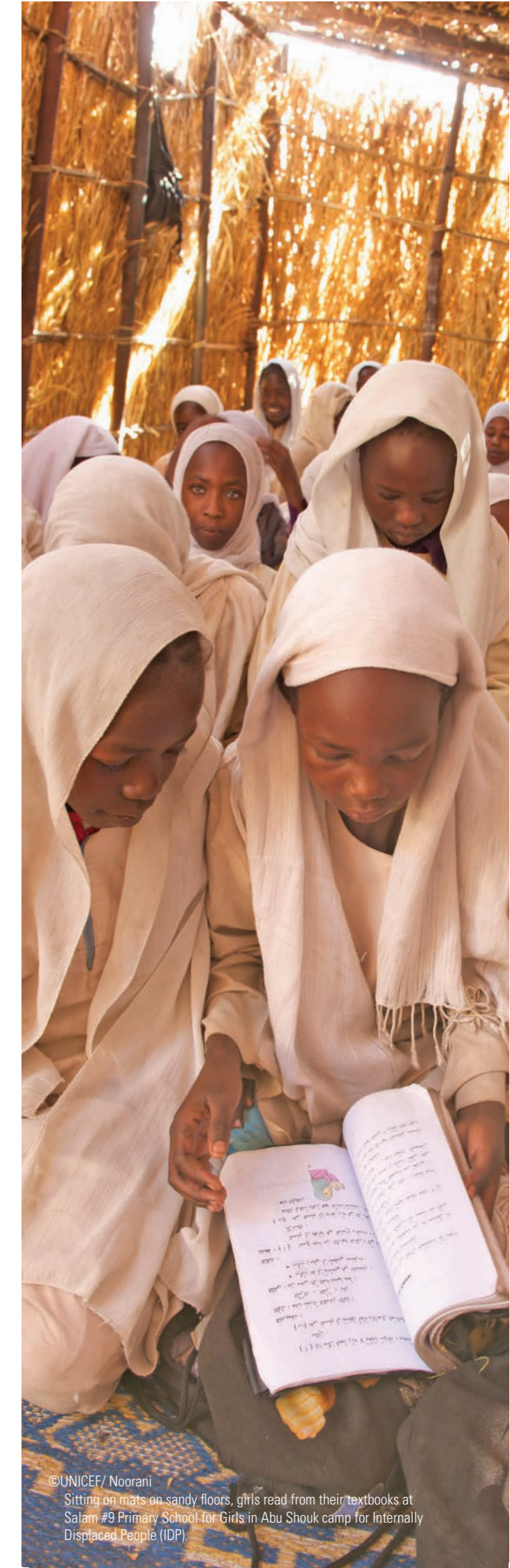
Sitting on mats on sandy floors, girls read from their textbooks at Salam #9 Primary School for Girls in Abu Shouk camp for Internally Displaced People (IDP).