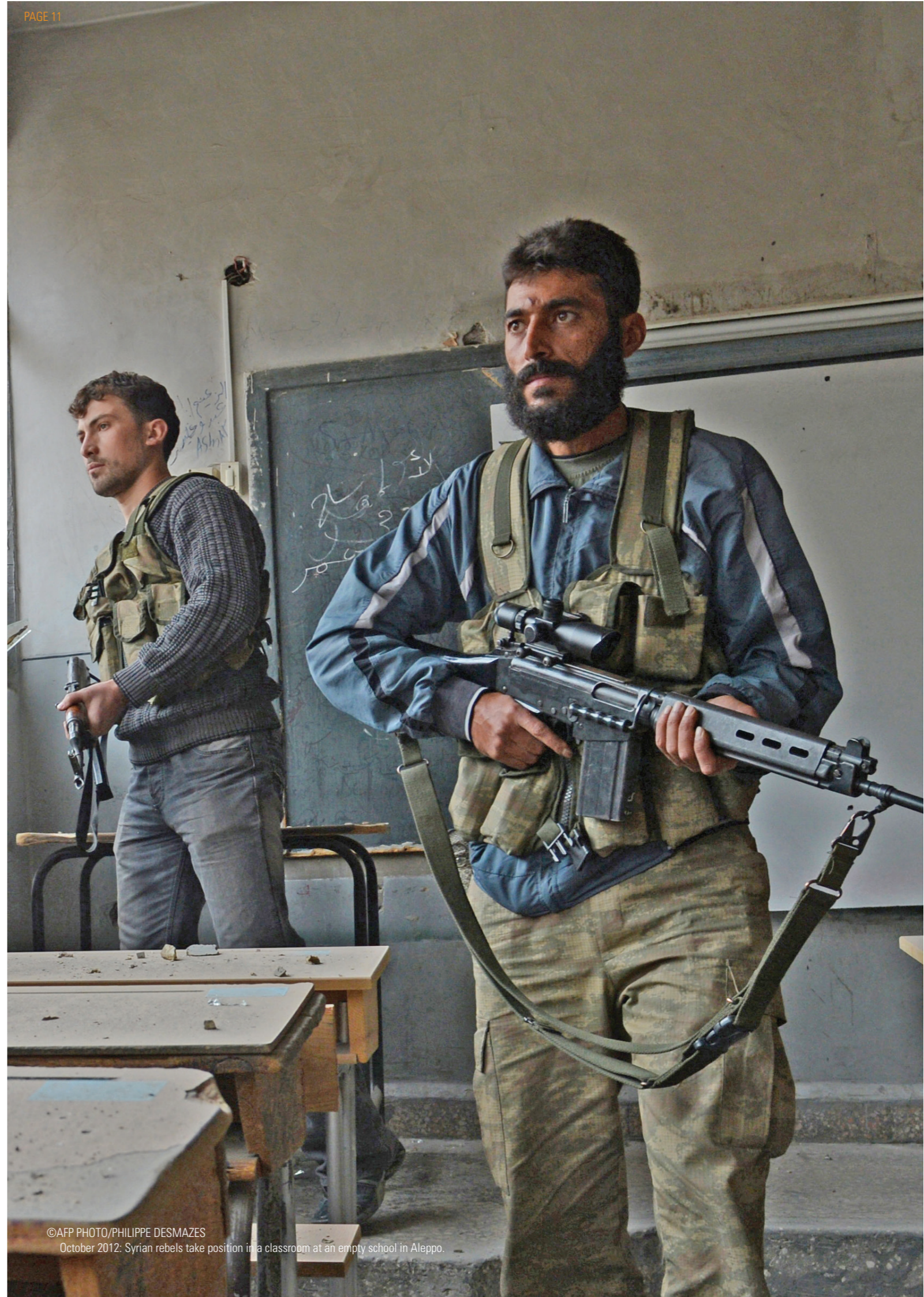
October 2012: Syrian rebels take position in a classroom at an empty school in Aleppo.