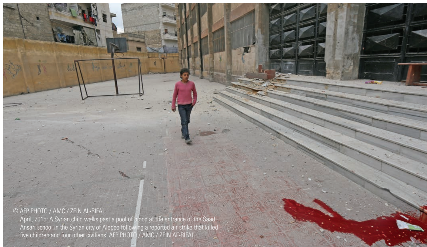
© AFP PHOTO / AMC / ZEIN AL-RIFAI April, 2015: A Syrian child walks past a pool of blood at the entrance of the Saad Ansari school in the Syrian city of Aleppo following a reported air strike that killed five children and four other civilians. AFP PHOTO / AMC / ZEIN AL-RIFAI

The images are as arresting as they are incongruous: the pool of fresh blood in the corner of a playground; the shrapnel-scarred blackboard inside a rubble-strewn classroom; the heavily-armed gunmen striding between the rows of empty desks.