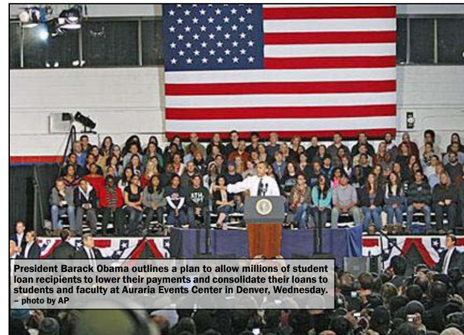
President Barack Obama outlines a plan to allow millions of student loan recipients to lower their payments and consolidate their loans to students and faculty at Auraria Events Center in Denver, Wednesday.