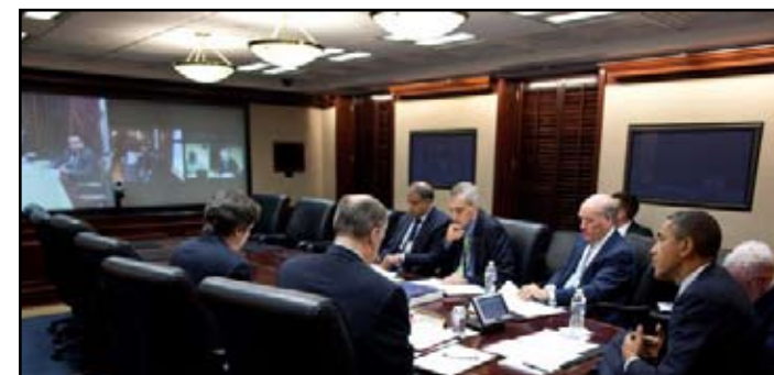
President Barack Obama talks with Prime Minister Nouri al-Maliki of Iraq during a secure video teleconference in the Situation Room of the White House, Oct. 21.

The United States will offer to help Iraq train and equip its forces, just