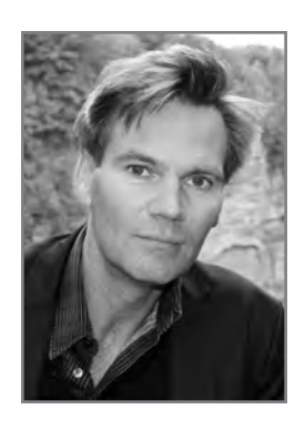
Service Award in recognition of service to a Chapter or to the Society to