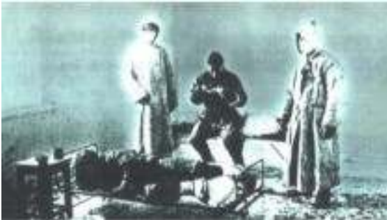
Figure 11. Japanese place infected prisoners alongside healthy prisoners to test reaction time of their new viruses. Available at www.aiipowmia.com/731/731coveat.html . Accessed 15 March 2005.

Medical researchers locked up diseased prisoners with healthy ones to see how quickly various diseases spread. To study the effects of pressure on the human body, researchers put some prisoners inside a pressure chamber; the