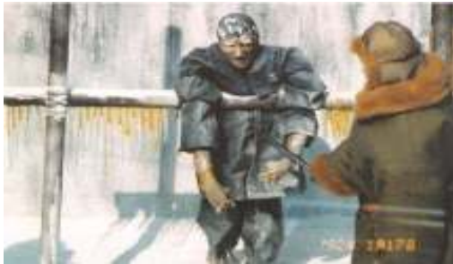
Figure 8. Replica of experiments for frostbite from Unit 731 Exhibit. Hal Gold, Unit 731 Testimony , 132.

Another story tells of the process used by the Japanese military for thawing out frostbitten extremities. The Japanese exposed prisoners to extreme cold and sprayed them with salt water, and then, as gangrene started to form, they would start amputating limbs to keep the victim alive. "To determine the treatment of