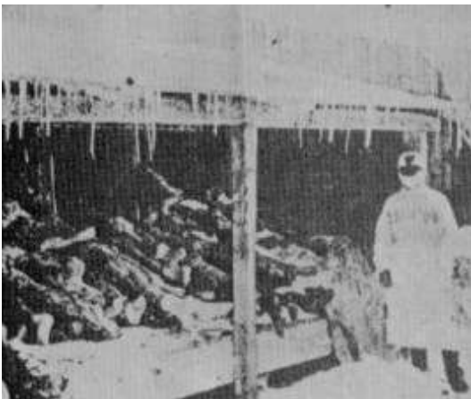
Figure 12. Stacks of victims awaiting disposal at the crematorium. Available at www.aiipowmia.com/731/731coveat.html . Accessed 15 March 2005.

During World War II, the handling of other Asians by the occupying forces of the Japanese military, at times, seemed barbaric. “The Japanese were responsible for 20-30 million Chinese casualties during their 14-year occupation, not to mention the 9 million Koreans, 4 million Indonesians, 2 million Vietnamese, 1.5 million Indians, 1 million people from the Philippines, and the other Asian