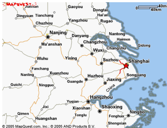
Figure 15. Map of Shanghai/Ning Bo area. Available at Mapquest.com. Accessed 15 March 2005.

At the conclusion of the five-month campaign, cholera, typhus, and the plague were spread throughout Ning Bo and at least five surrounding counties. The diseases released in 1940 had long-term effects in Ning Bo, as the nearby communities had outbreaks of plague in 1940, 1946, and 1947. The diseases took a heavy toll on the area; and many people lost their lives after the war was over.