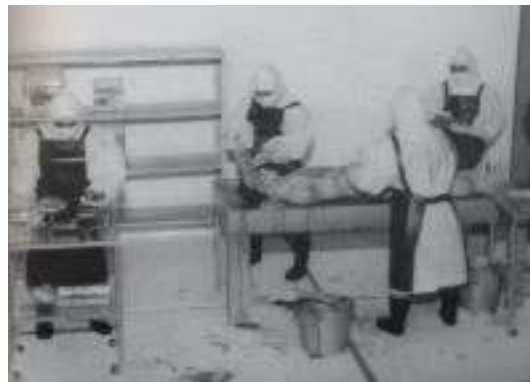
Figure 21. Display of Unit 731 exhibit of scientists removing organs during dissection.