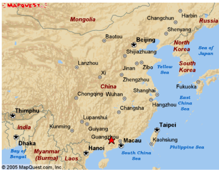
Figure 5. Map of Yunnan area Southeast China. Available at Mapquest.com. Accessed 15 March 2005.

Furthermore, the camps were located in an area of China that was loyal to the