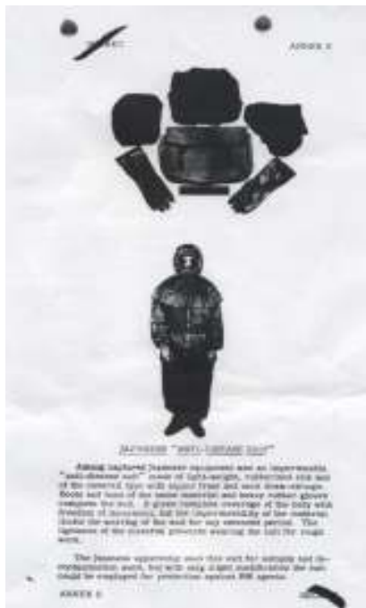
Figure 17. Diagram of Japanese anti-disease suit.

The news of Japan's surrender devastated Ishii. He could not accept the idea that an inferior people defeated Japan. When Emperor Hirohito was heard on the radio asking the Japanese people to end the war, Ishii had a nervous breakdown. Once he was assured that Ping Fan had been destroyed, Ishii boarded a military aircraft to return home. Members of his family along with data and equipment from Ping Fan were sent by railroad to Pusan, Korea. It was from Korea that some