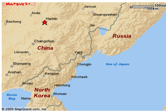
Figure 4. Map of Harbin area in Manchuria. Available at Mapquest.com. Accessed 15 March 2005

Bix is very critical of the Allies for ignoring the deaths caused by Unit 731 in China. The Allied war crimes tribunals in Yokohama, Japan, choose to bring only thirty people to trial for the slaughter committed in China. Of the thirty, only twenty-three were convicted of various charges; of those, only five were sentenced to be executed. "The attitude of the Americans changed in 1950 due to the start of the Korean War; the United States lost interest in punishing Japan, an enemy turned ally." 25 In 1950 MacArthur, acting as supreme allied commander for Allied Forces, "reduced most of the sentences, and by 1958, all those convicted