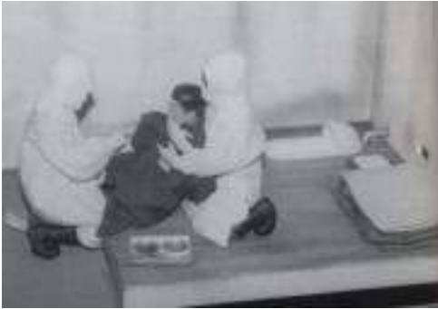
Figure 3. Prisoner being injected with pathogens from Unit 731 Exhibit. Hal Gold, Unit of 731 Testimony , 132.

soldiers from disease outbreaks. They also felt that they were preparing for a possible attack from an enemy nation. Therefore, they were trying to prevent needless death from a germ warfare attack against Japan.