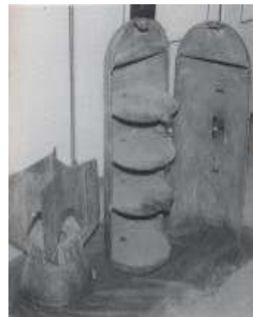
Figure20. Bomb China claims was used by U.S. during Korean War. Hal Gold, Unit 731

During the Korean War, the Chinese made accusations that American troops carried out germ warfare against the Chinese and North Korean armies along with the general population in North Korea. Masanori Tabata of the Japan Times reported on September 5, 1982, that these accusations had