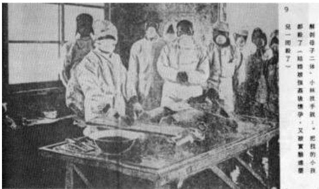
Figure 7. Japanese scientists perform vivisection on female victim. Available at www.aiipowmia.com/731/731coveat.html . Accessed 15 March 2005.

Planes sprayed a proving ground called Anda, with their manufactured plague culture, they also dropped bombs with plague-infected fleas to see how many casualties would occur. Prisoners were chained to stakes as the researchers detonated bombs filled with deadly anthrax, plague, and gas gangrene in order to track the spread of disease through their bodies; sometimes the researchers dissected them while the victims were still alive. The former medical assistant of a Japanese Army Unit in China during World War II recalled how “The prisoner knew that it was over for him, and so he did not struggle. However, when he