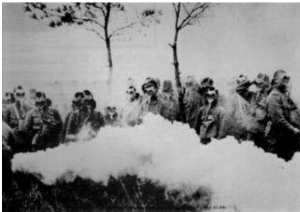
Figure 2. Japanese using prisoners to field test new gas masks. Available at www.aiipowmia.com/731/731coveat.html . Accessed 15 March 2005.

General Ishii Shiro had a virtually no restrictions and had no need or desire to work with others in the Japanese Army Medical Department. He acted as if he had