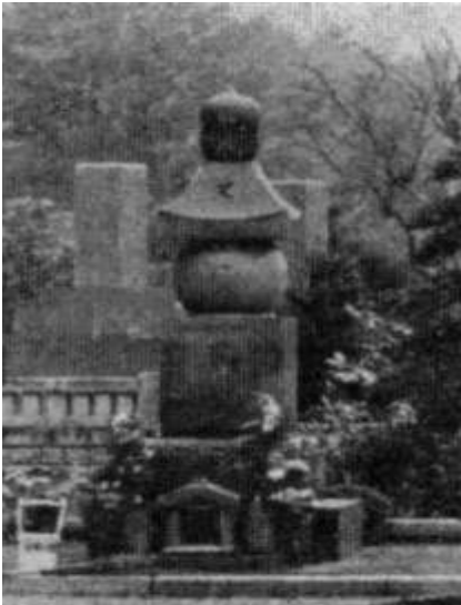
Figure 18. Tokyo Memorial Tower for Unit 731. Available at www.aiipowmia.com/731/731coveat.html . Accessed 15 March 2005.

The Japanese Yasukuni Shrine honors 1,068 war heroes; this number includes