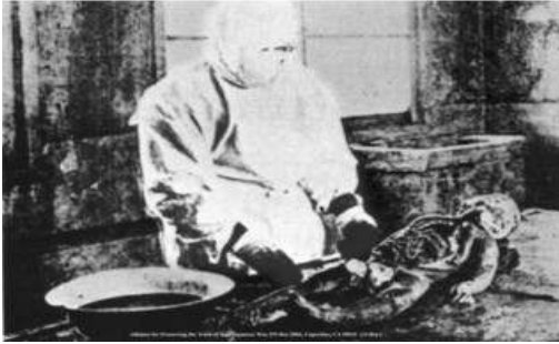
Figure 9. Japanese scientist perform vivisection on infant victim. Available at www.aiipowmia.com/731/731coveat.html . Accessed 15 March 2005.

The ghastly treatment by the Japanese also included burning victims with