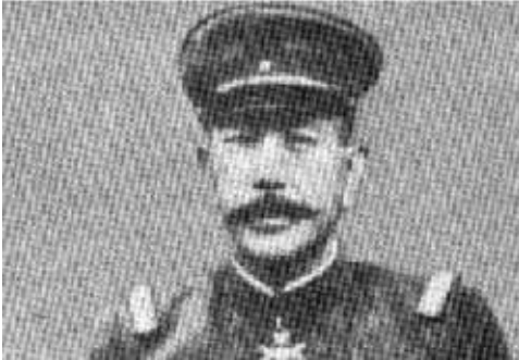
Figure 1. Ishii Shiro Commander of Unit 731, founder of Japanese Biological Warfare Division of the Army. Available at www.aiipowmia.com/731/731coveat.html . Accessed 15 March 2005.

Ishii Shiro was born into a wealthy family on June 25, 1892, in the village of Chiyoda Mura, a farming village in the Kamo district, Chibe prefecture, and southeast of Tokyo. His family was quite wealthy and was the community's largest landowner. Ishii's relatives exercised feudal dominance over the local people. His