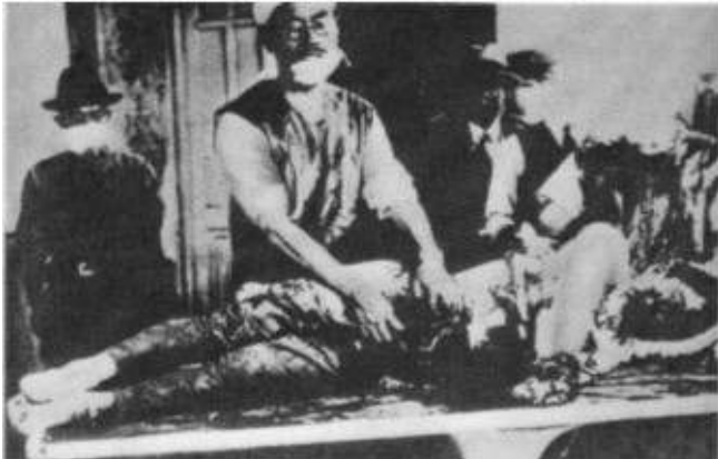
Figure 6. Japanese scientists perform vivisection on male victim.