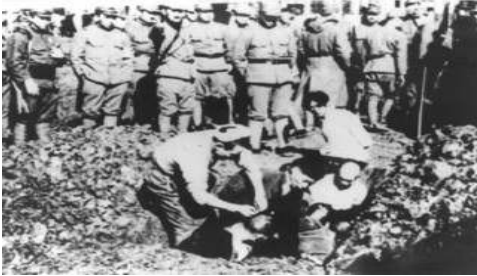
Figure 10. Japanese bury prisoners alive. Available at www.aiipowmia.com/731/731coveat.html . Accessed 15 March 2005.

The Japanese would bury victims while they were still alive; they also castrated the males, removed internal organs to practice surgical procedures, and