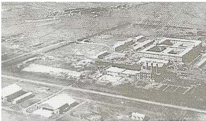
Fig. 14. Aerial view of Ping Fan facility created by Ishii Shiro.

Ishii built a self-sufficient installation with intricate germ and insect breeding facilities, there was a prison for his human subjects, testing grounds, an arsenal for