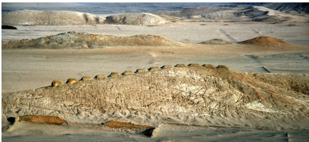
Fig. 3.3.3. The Thirteen Towers as seen from the Fortress.