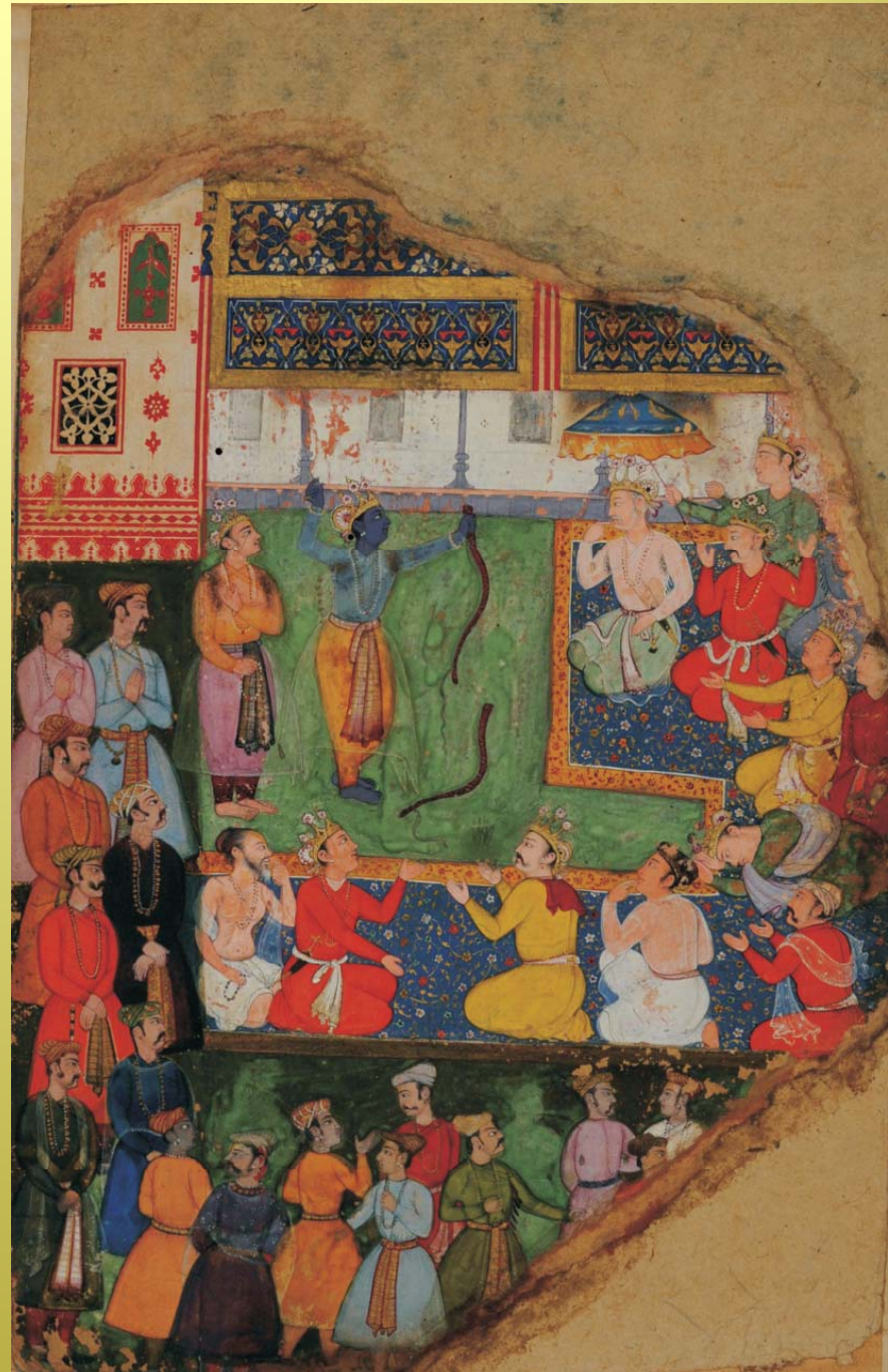
Provincial Mughal style Orchha, Bundelkhand Early 17 th century (1610-15) Paper, 34.5 x 24.2 cm Acc. No. 56.114/11