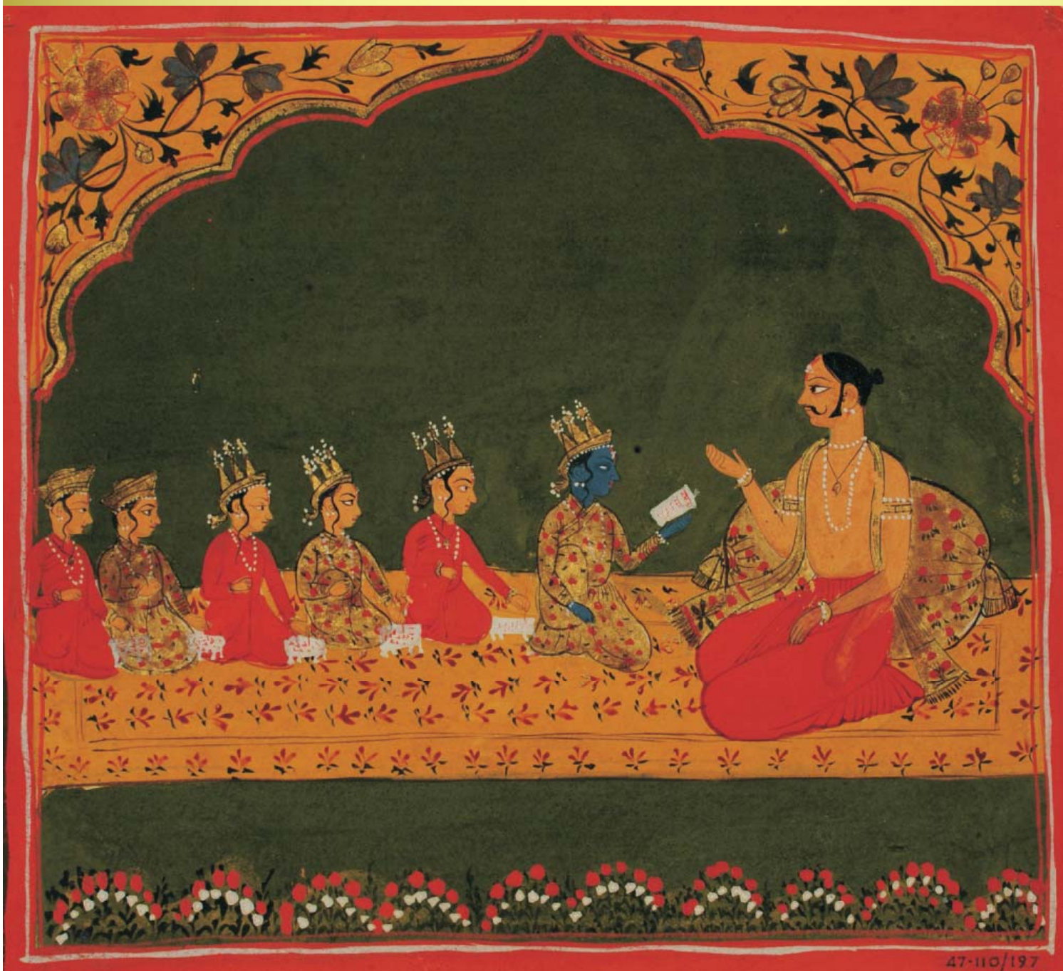
Bikaner- Deccan Mixed Style Early 18 th century Paper, 15.6 x 17 cm Acc. No. 47.110/197