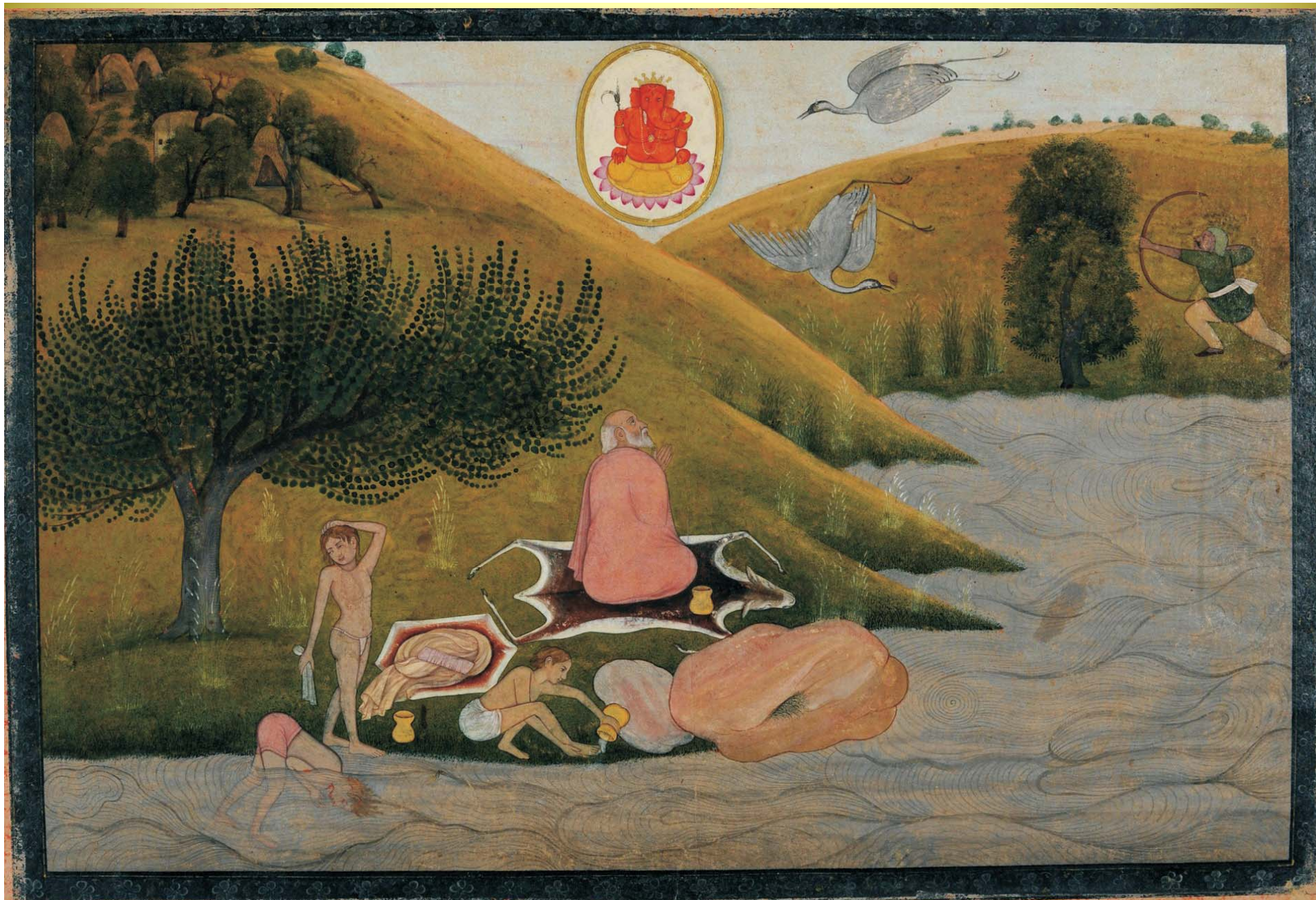
VALMIKI MEDITATING ON THE BANKS OF RIVER TAMAS SEES THE HUNTER HUNTING KRAUNCH BIRDS