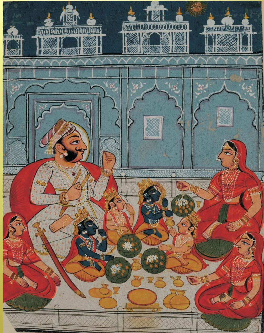
Kotah Style, Rajasthan Late 18 th century Paper, 28.5 x 22 cm Acc. No. 62.450