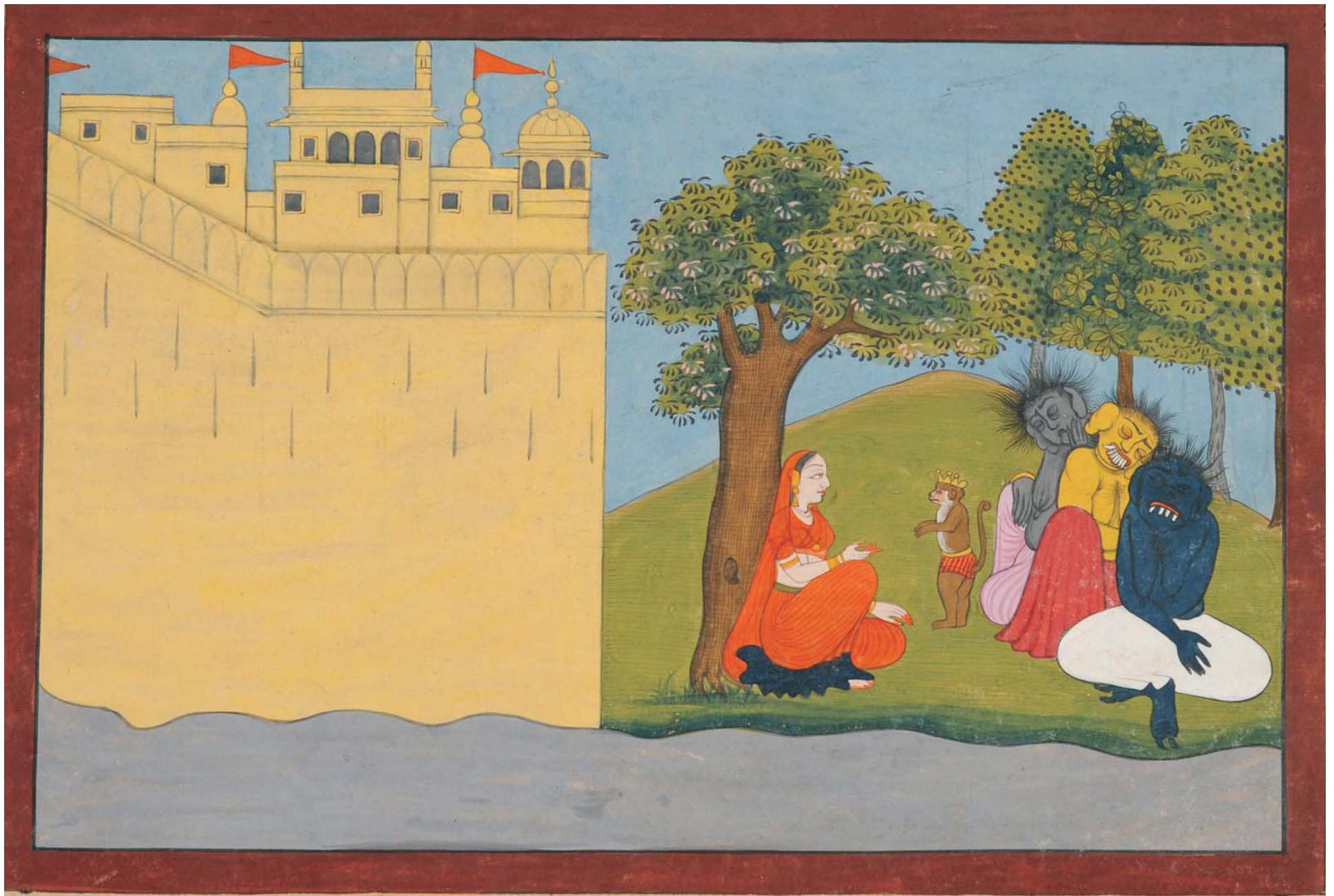
HANUMAN IN A DWARFED FORM APPEARS BEFORE SITA IN THE ASOKA-VATIKA Bilaspur style, Pahari Circa A.D. 1770 Paper, 30.5 x 40.5 cm Acc. No. 61.1478