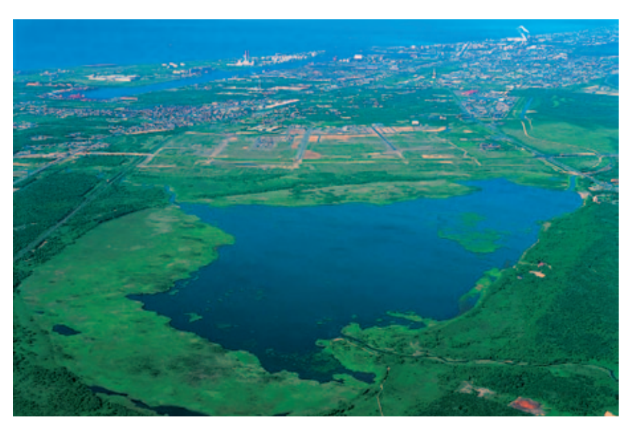
Full view of Utonai-ko

Geographical Coordinates: 42°42'N, 141°43'E / Altitude: 1-5m / Area: 510ha / Major Type of Wetland: Freshwater lake, low moor / Designation: Special Protection Area of National Wildlife Protection Area / Municipalities Involved: Tomakomai City, Hokkaido Prefecture / Ramsar Designation: December 1991 / Ramsar Criteria: 2, 5