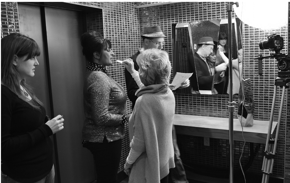
Behind the scenes pictures from the filming of the 2012 Dining Out for Life public service announcement (PSA). Daisy Martinez (top left), Pam Grier (bottom left) and Ted Allen (right) star in the 2012 PSA promoting Dining Out for Life on April 26th.