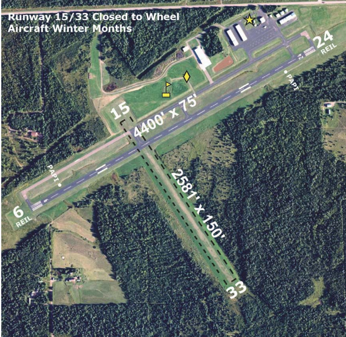
Two Harbors Municipal - Richard B. Helgeson Field

Runway 15/33 Closed to Wheel Aircraft Winter Months