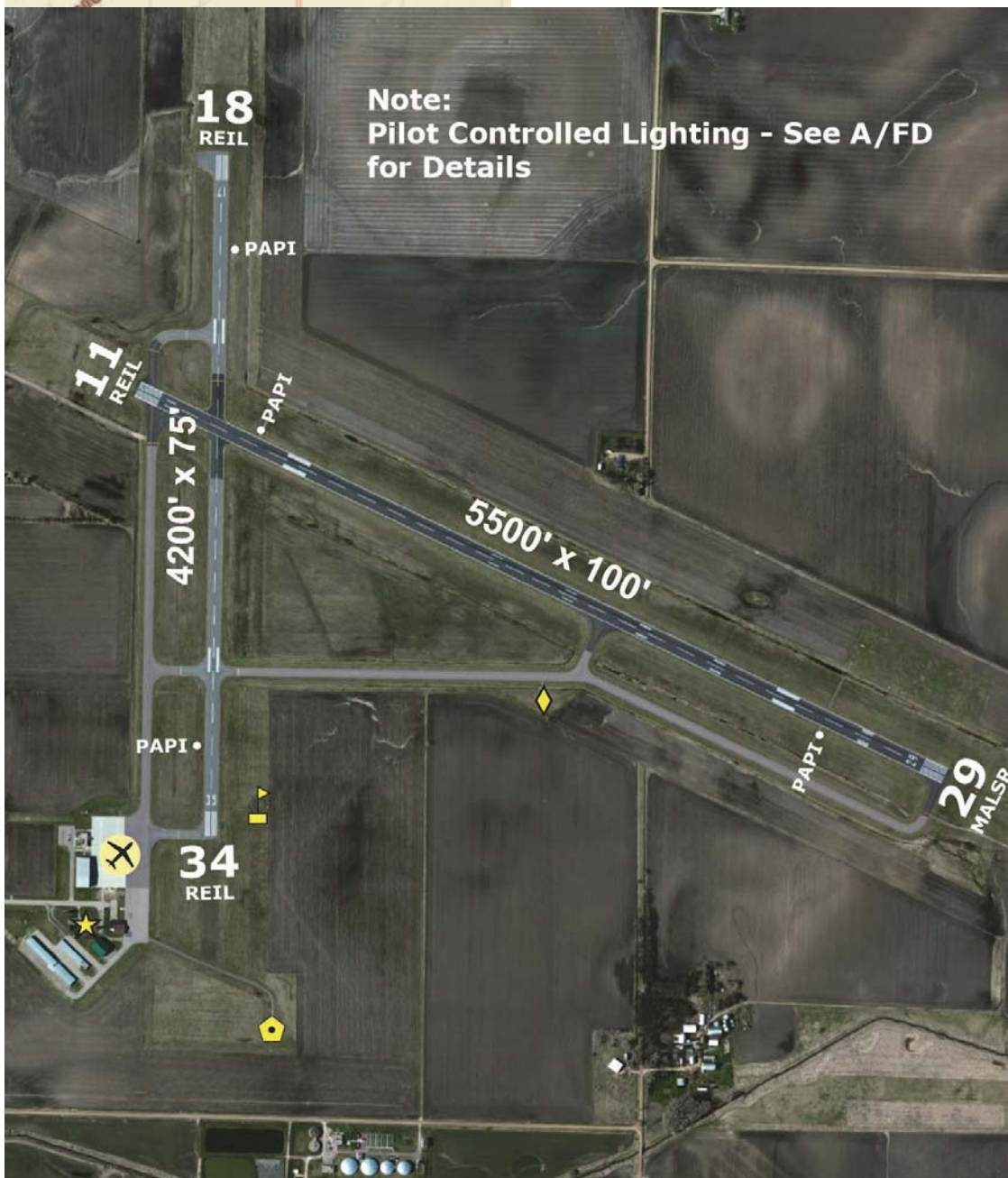
Worthington Municipal Airport