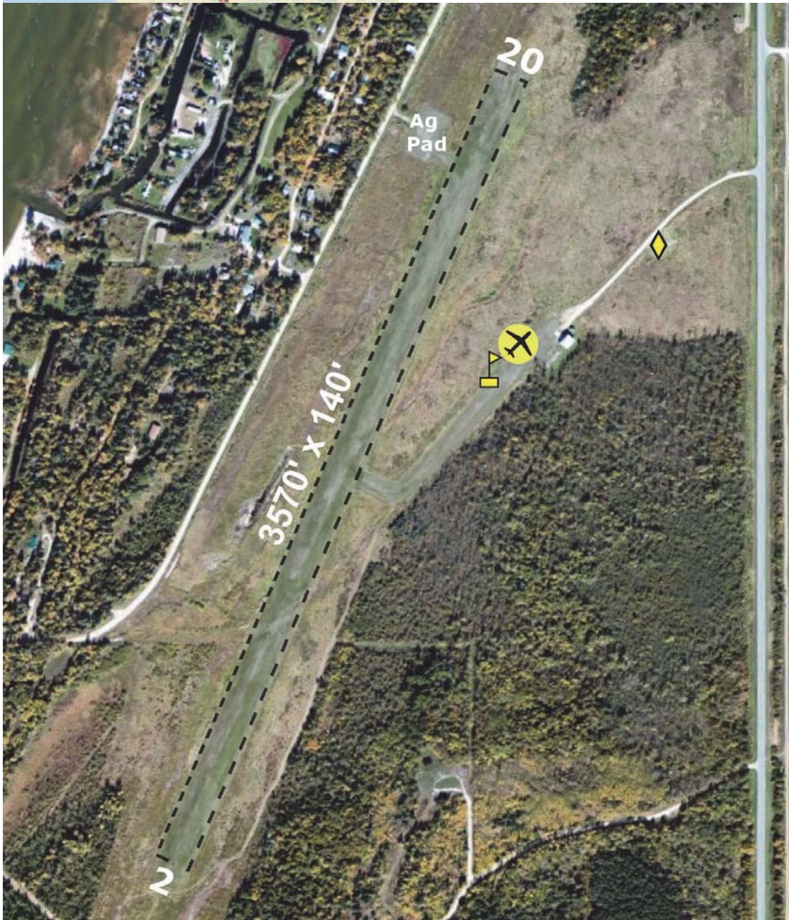
Waskish Municipal Airport