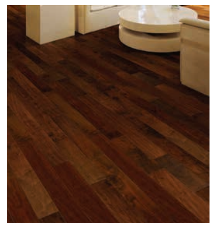
Irish Setter Walnut