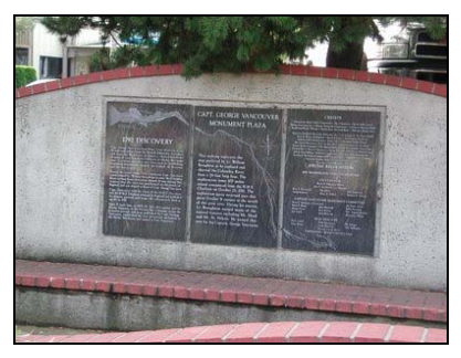
Capt. Vancouver Plaza sign