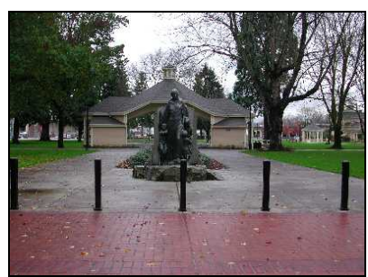
Pioneer Mother statue