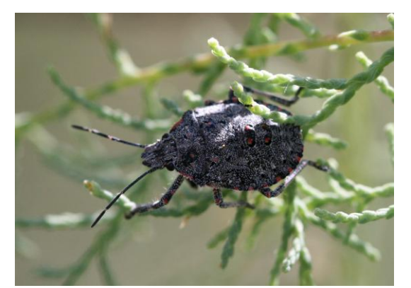
Figure 2. Rough stink bug nymph.

Life History and Habits: Rough stink bugs feed primarily on leaves and developing seeds of trees and have been recorded from ash, walnut, willow, boxelder and many other species. However, they do not appear to be associated with any significant plant injuries. In addition,