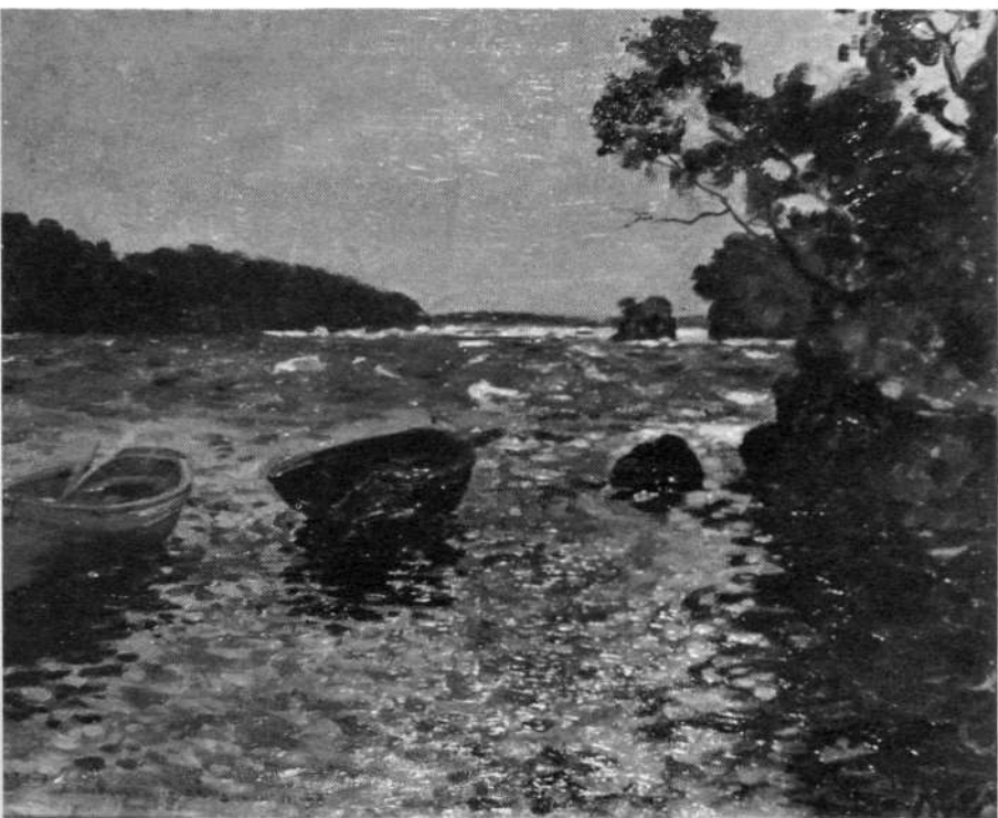
NAIRN Patterson's Inlet, Stewart Island Cat No 25