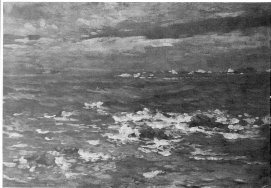
NAIRN Barrett's Reef, Wellington Cat No 22