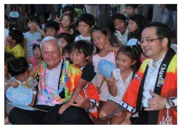
Honolulu Mayor Kirk Caldwell being greeted by the children of Chigasaki at the welcoming ceremony.