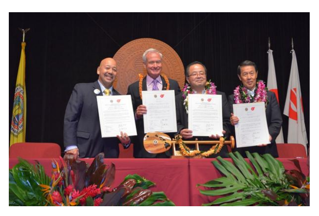
Just after the signing at Mission Memorial Auditorium