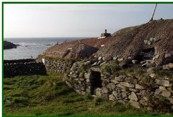
Gearranan Blackhouse, Lewis