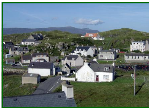
Isle of Scalpay