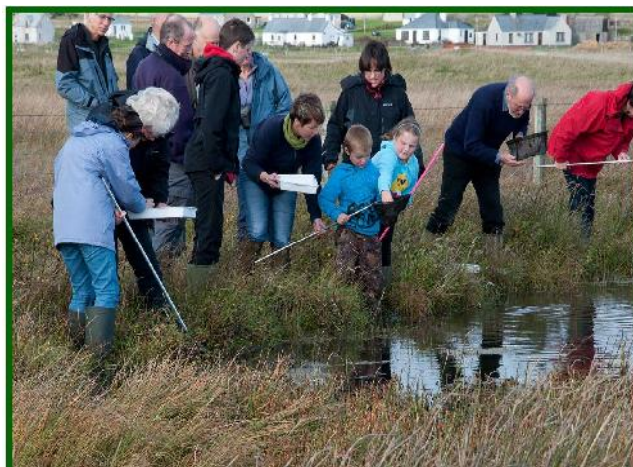
Loch Stiapabhat, Ness, Isle of Lewis