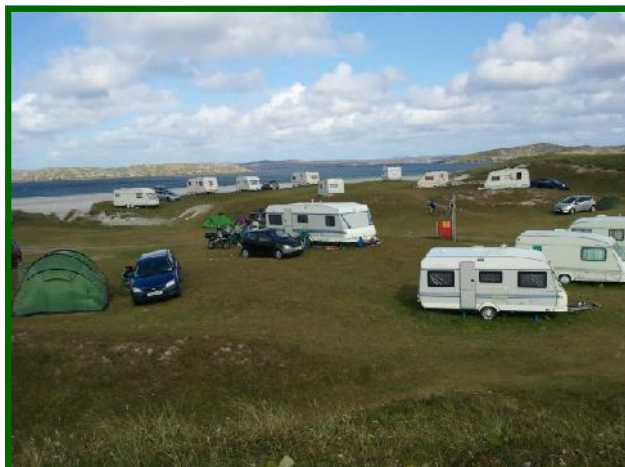
Reef, Uig, Isle of Lewis