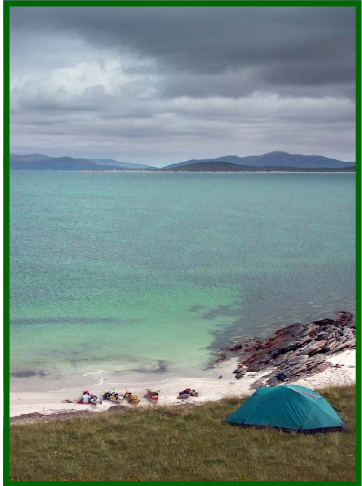
View from Taransay to Harris