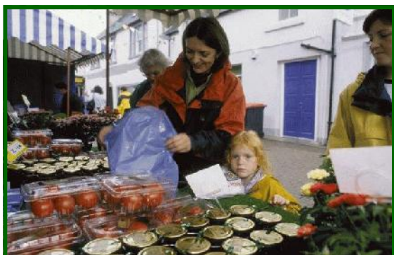
Stornoway Outdoor Market