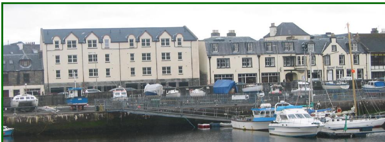
Stornoway, Isle of Lewis