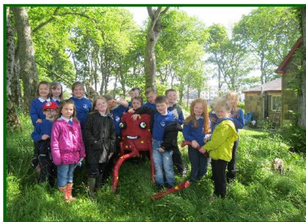
Exploring Stornoway Castle Grounds for Biodiversity week