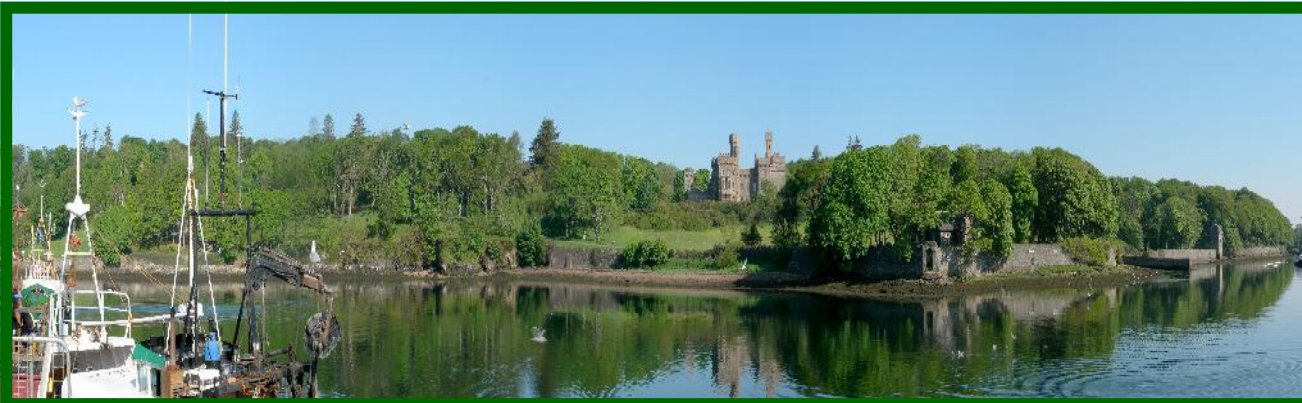
Stornoway, Isle of Lewis