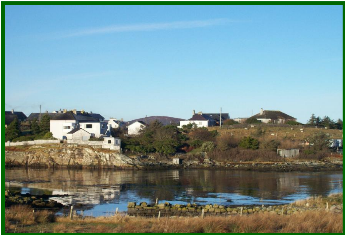
Lochmaddy, North Uist