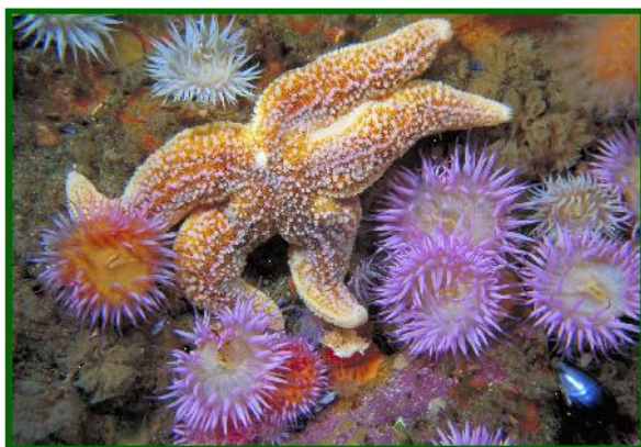
Sea Anemones & Starfish, St Kilda