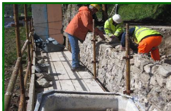
Repairing Lews Castle walls