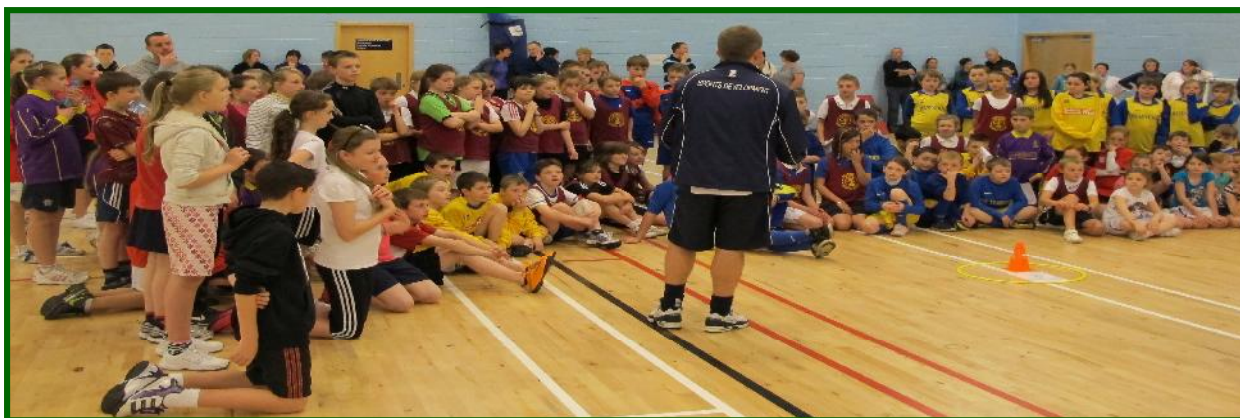
Sports Festival Event