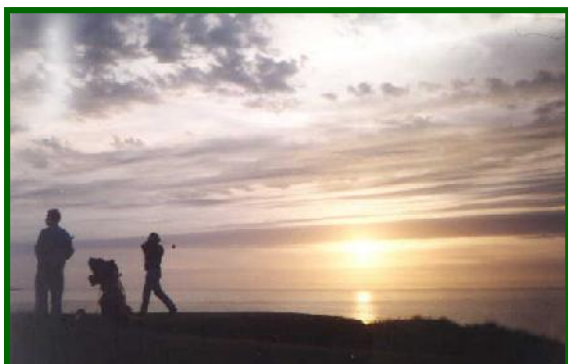
Harris Golf Course