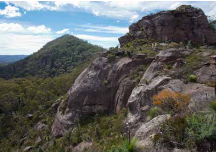
Bare Rock Bluff, Wollemi wilderness. All wilderness inside national parks deserves protection under Federal environmental law.

Here I have to confide in instincts and do the right thir you that when I began to no matter how hard the task.