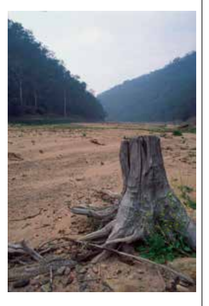
The iconic lower Kowmung River could become a sediment filled ditch. like the lower Coxs River where it reaches Lake Burragorang

the Hawkesbury-Nepean Valley, including the options of raising the Warragamba Dam wall and road upgrades which would permit those living on the floodplain to escape major floods. This brief is almost identical to an October 2012 recommendation to the O'Farrell Government by Infrastructure NSW. This organisation is chaired by ex-