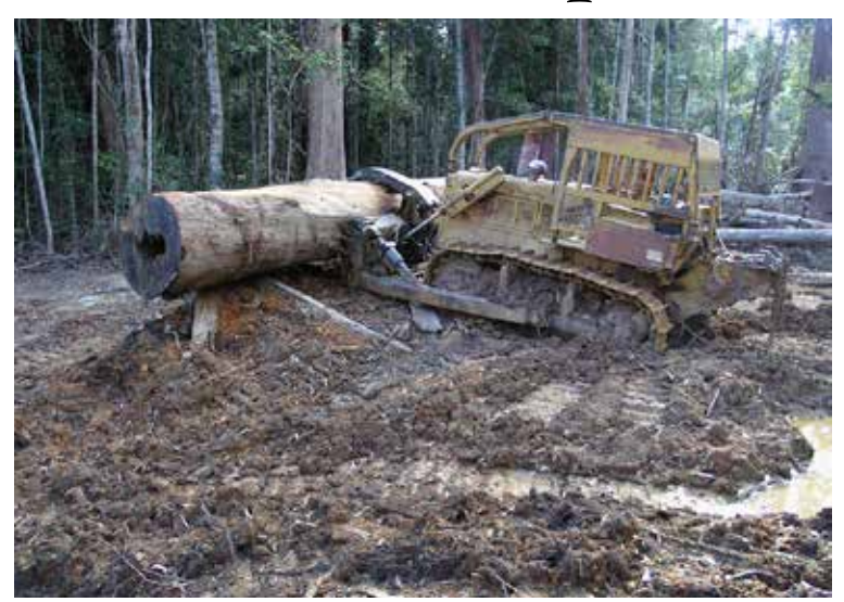
The Shooters want to use their political clout to force logging and other forms of resource exploitation into national parks

Many people who don't get the complexities of planning, national parks for multiple i do love and appreciate national