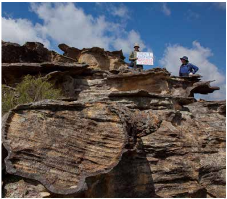
Internationally significant platy Pagodas are found right across the Coalpac project area.