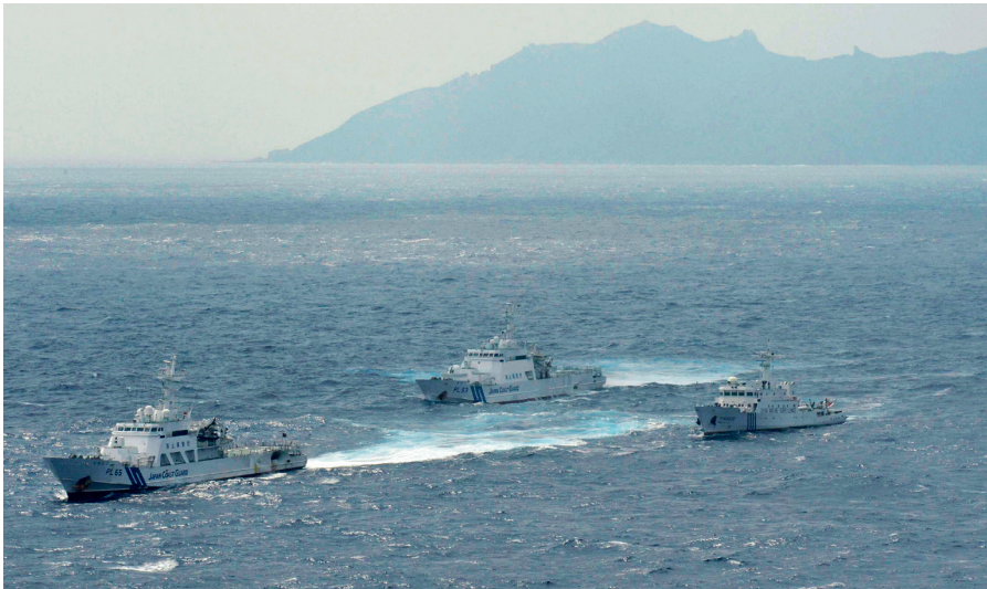
A Chinese marine surveillance ship cruising next to Japan Coast Guard patrol ships in the East China Sea, in the background the Senkaku/Diaoyu islands, 24 September 2012

Maritime tensions in East Asia derive from two factors: territorial disputes between China and its smaller neighbours, and Sino-American disagreement regarding access rights and the question of Taiwan. China is seeking to change the regional status quo by leveraging its superior military and policing capacity, and the resultant insecurity has led other powers to seek American support. Due to the growing size of Chinese naval expenditure, a doctrinal race is emerging between the US and Chinese militaries, even as diplomatic efforts are made to prevent further escalation.