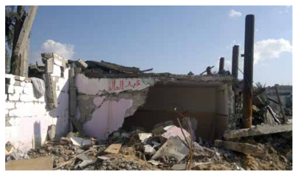
The Abdel Aal family home

to various places due to the constant fear of the police station close to the house being targeted.