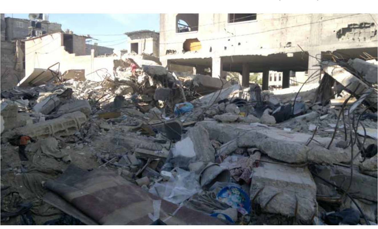
The ruins of the Salah house

PCHR believes that the direct targeting of a civilian object, resulting in the death or injury of civilian inhabitants, constitutes the crime of willful killing, a grave breach of the Geneva Conventions. It could reasonably be expected that attacking a civilian house would result in the injury or death of its civilian inhabitants.