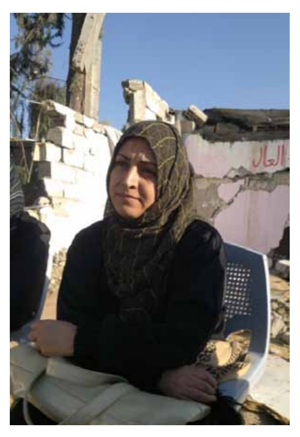
Daughter of Nawal Abdel Aal before the rubble of their home