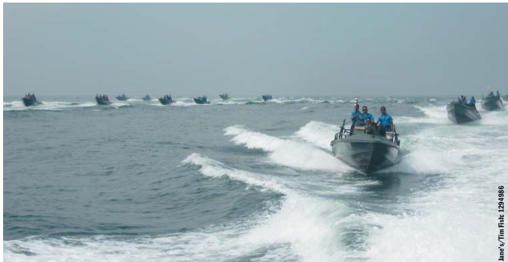
Jane's/Tim Fish: 1294986

The SLN's IPCs employed infantry-style tactics to confront the Sea Tigers. An IPC flotilla would conceal its numbers by moving in single file and maximise its firepower by attacking in an arrow-head formation.