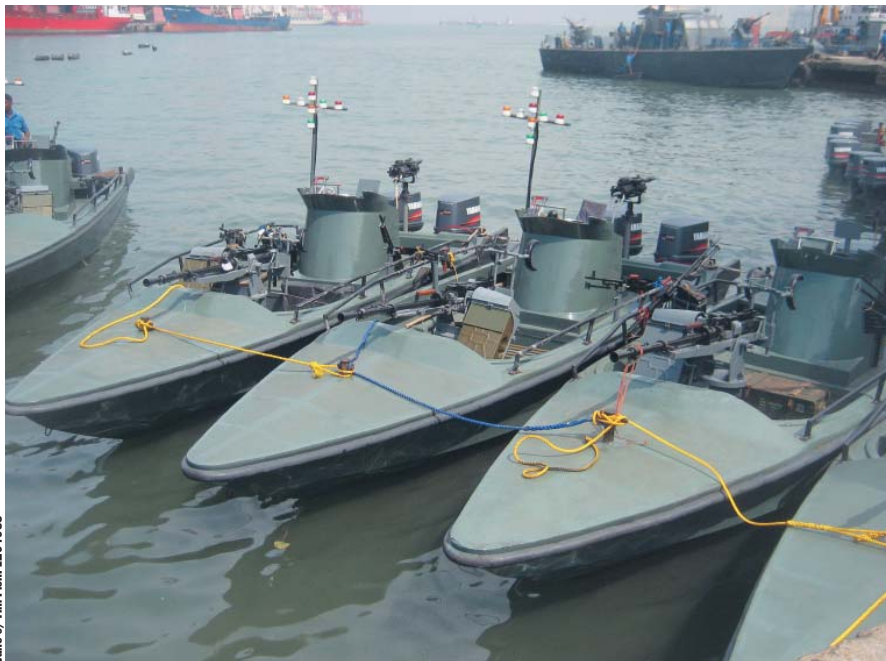
Jane's/Tim Fish: 1294988

The 23 ft Arrow boats are the smallest IPCs used by elite SBS teams for covert operations. The arrangement of coloured lights on the mast is used for identification during night operations, at the risk of attracting enemy fire.