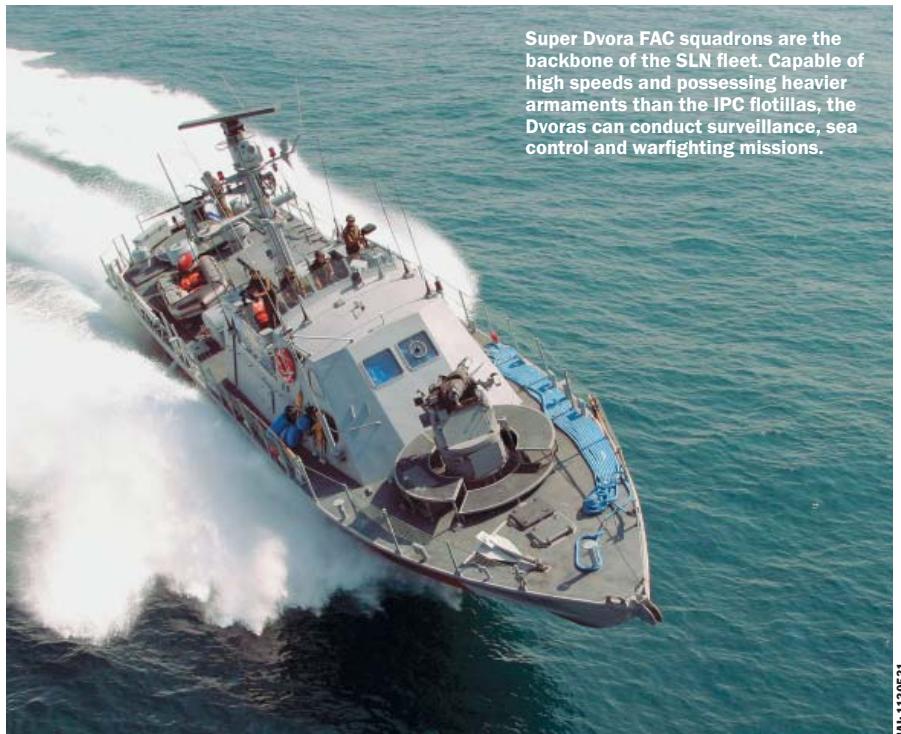
Super Dvora FAC squadrons are the backbone of the SLN fleet. Capable of high speeds and possessing heavier armaments than the IPC flotillas, the Dvoras can conduct surveillance, sea control and warfighting missions.

Hundreds of indigenously produced fibreglass IPC have been built in three variants for operations in different sea states. The smallest is the 23 ft-long Arrow; a second class is 14 m long, with both types able