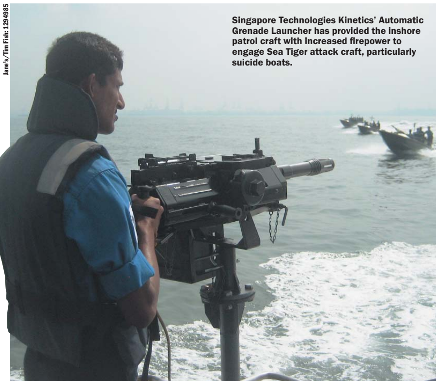
Singapore Technologies Kinetics' Automatic Grenade Launcher has provided the inshore patrol craft with increased firepower to engage Sea Tiger attack craft, particularly suicide boats.