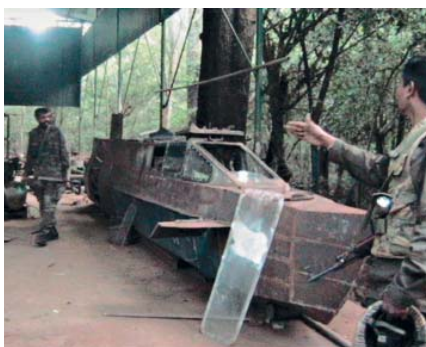
According to the SLN, the LTTE's use of underwater vehicles makes it "the first terrorist organisation to develop underwater weapons" and introduce naval and air arms to a conflict.

Although inflation is running at 20 per cent, the defence budget has risen by 6.4 per cent compared to FY08. The FY08 budget was 20 per cent more than that in FY07, which had seen a 46 per cent increase over FY06. According to Vice-Adm Karannagoda, the substantial increases in defence expenditure is explained by a lack of investment in previous years.