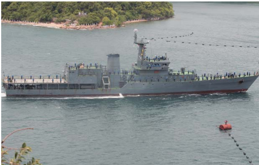
The 18-year-old Sayura is the largest patrol ship in the SLN. Without a main gun, the OPV is equipped with a 105 mm artillery piece to destroy the LTTE's warehouse ships. Built by Hindustan Shipyards in Visakhapatnam, India, Sayura was in Indian service from 1991–2000.

Jane's reported in December 2008 that Sri Lanka's parliament approved a naval budget of LKR22.6 billion (USD198 million) for operations and a further LKR4.9 billion for procurement for Fiscal Year 2009 (FY09). This allocation will come from the national defence budget of LKR177.1 billion, which was approved on 4 December.