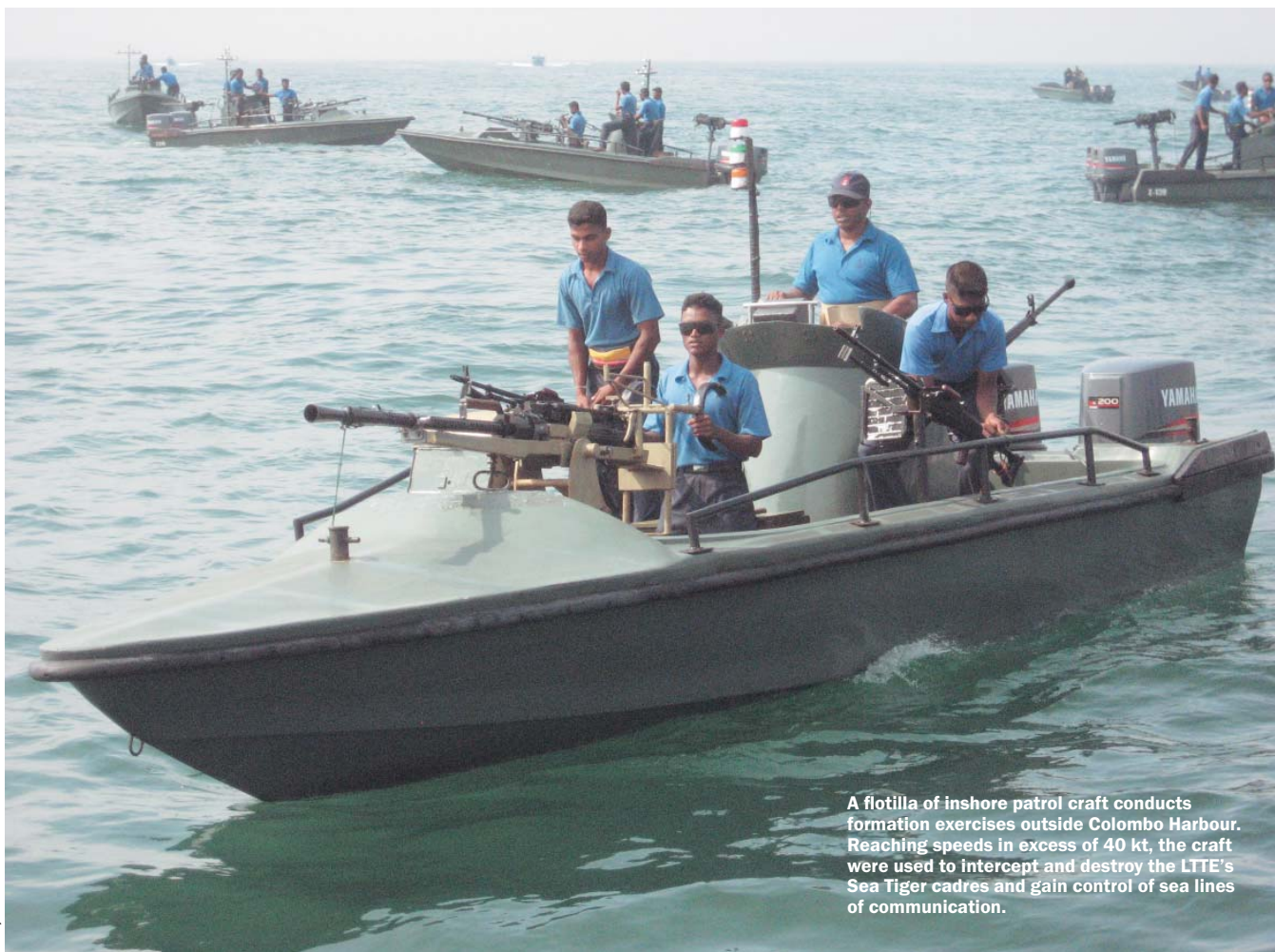
A flotilla of inshore patrol craft conducts formation exercises outside Colombo Harbour. Reaching speeds in excess of 40 kt, the craft were used to intercept and destroy the LTTE's Sea Tiger cadres and gain control of sea lines of communication.