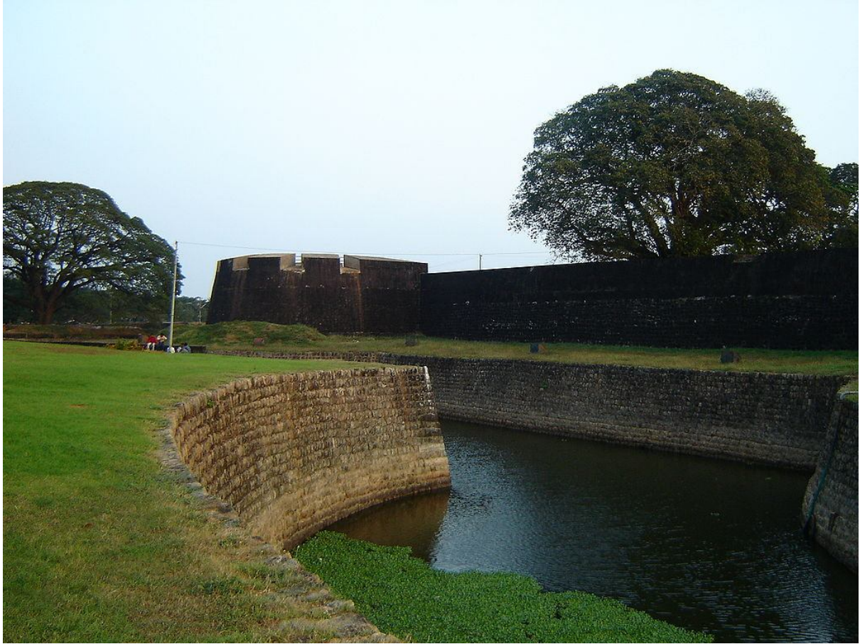
Palakkad Fort (Tippu's Fort)

Palakkad Fort also known as Tippu's Fort is an ancient granite Fort situated in the very heart of Palakkad Town. Elsewhere Forts are generally shields against fighting enemy. Here it was for communication between Palakkad and Coimbatore. It was built by Haider Ali of Mysore in 1766. The fort was taken over and modified by the British in 1790. It is now preserved by the Archaeological Survey of India. It houses a small museum and an open air auditorium. There is a children park also where children make merry of the things.