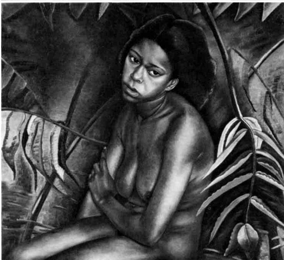
*27. PRUDENCE HEWARD Fruit in the Grass c. 1939