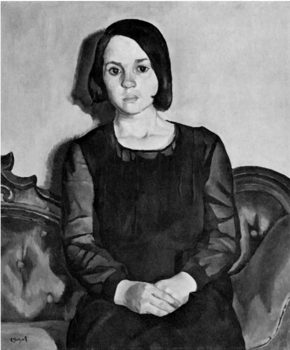
18. EDWIN H. HOLGATE Interior c. 1933