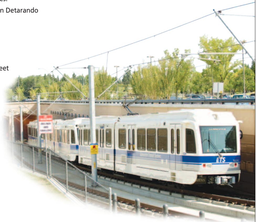
A train enters the tunnel portal at Belgravia Road.