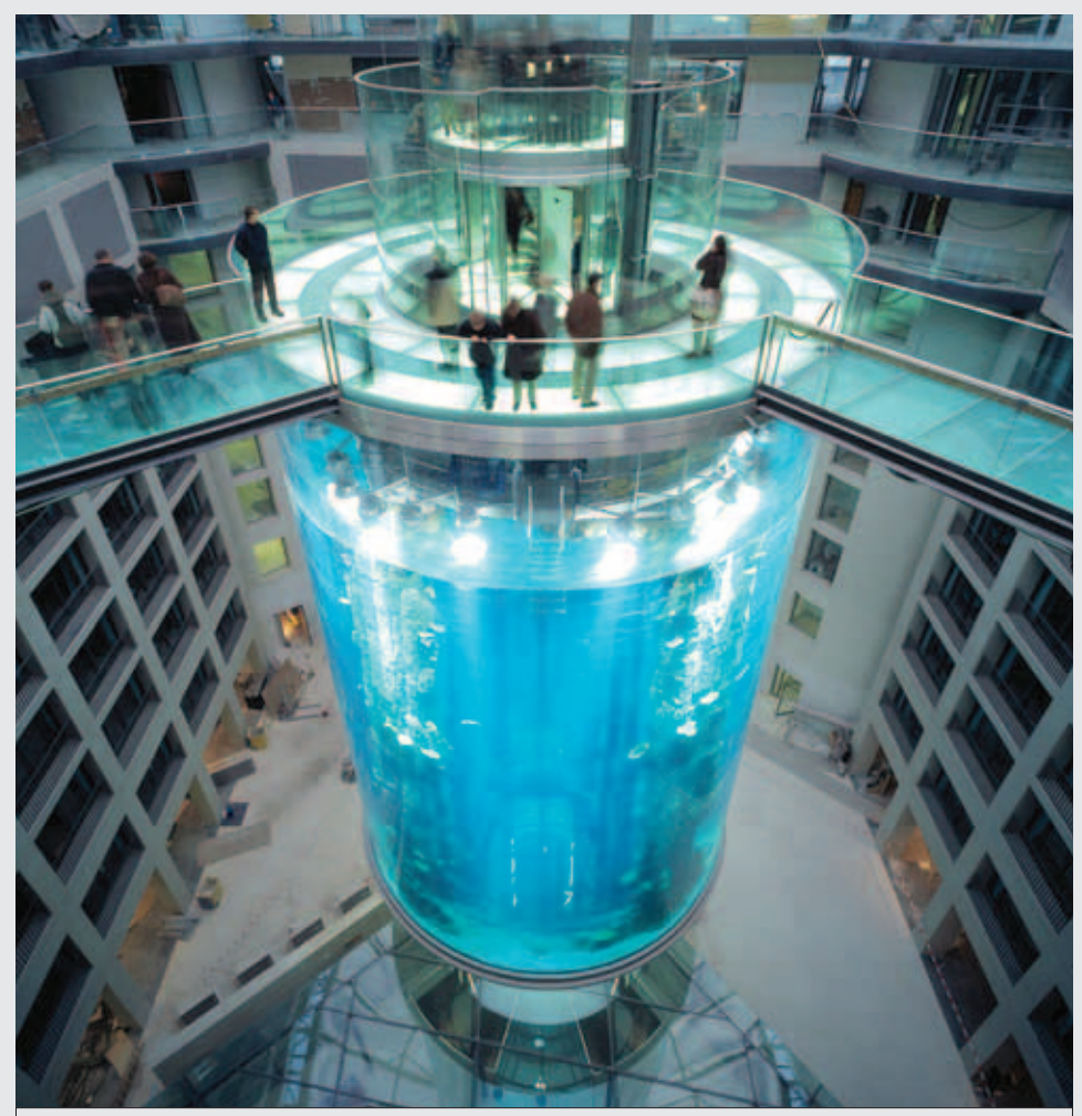
MMA was the raw material for this ground-breaking aquarium, which forms the centrepiece of Berlin's DomAquaree hotel and leisure complex. Suspended 8 m off the ground, the cylindrical aquarium is made from 150 tonnes of high-optical clarity acrylic. A seven-minute narrated elevator ride through the structure allows a good view of more than 2,500 fish swimming in the one million litre artificial seascape

One of the biggest growth sectors for Lucite's SpMAs is in surface coatings, which include automotive finishes, lubricants, inks and adhesives. Its durability has made it attractive to the surface coatings industry, as has worldwide environmental legislation which is driving the increased use of waterborne coatings with low solvency ratings.