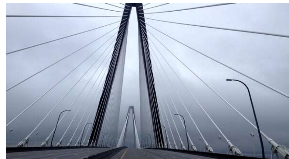
Closures to the Ravenel Bridge required re-routing Mt. Pleasant Services to the Don Holt.