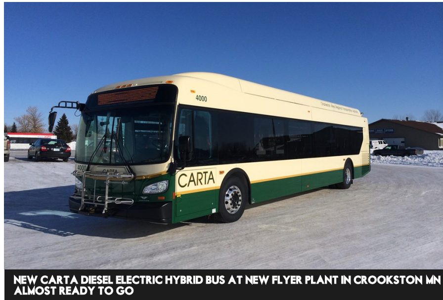
NEW CARTA DIESEL ELECTRIC HYBRID BUS AT NEW FLYER PLANT IN CROOKSTON MN ALMOST READY TO GO