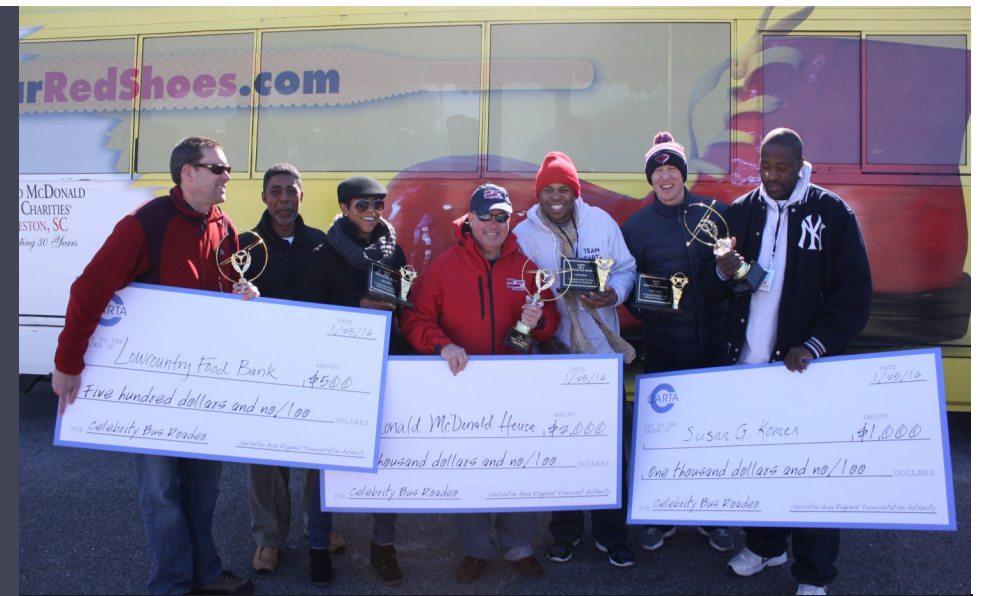
CELEBRITY PARTICIPANTS—JANUARY 25, 2014