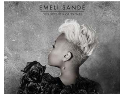
Emeli Sandé Our Version Of Events