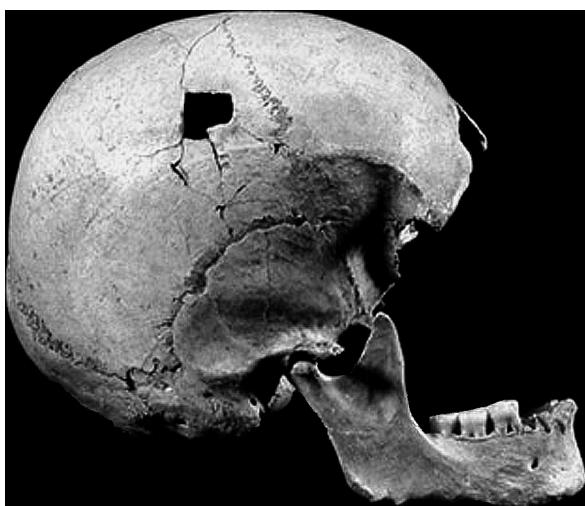
Fig. 2.1 The Stetten 2 skull from Vogelherd, Germany, attributed to the Aurignacian; the Stetten human remains are in fact all of the late Neolithic

The Cro-Magnon sample White cites, derived from four adults and three or four juveniles, had been subjected to so much pseudoscientific spin that separating it