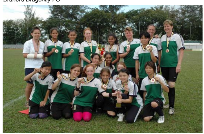
The women's team from the Berakas International School