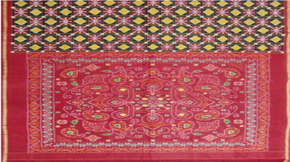
IKAT Pure silk saree