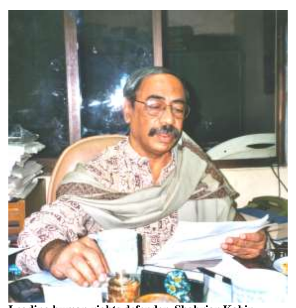
Leading human rights defender, Shahriar Kabir.

In 1998, the United Nations general assembly recognized human rights defenders, their rights and responsibilities (See the Declaration on Human Rights Defenders – resolution 53/144 of 9 December 1998).