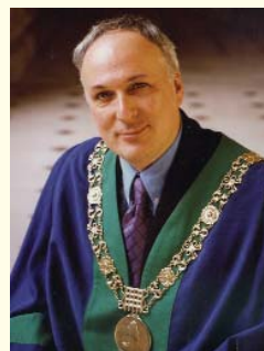
Cllr. Dermot Lacey Lord Mayor of Dublin

Telephone: 676 1845 & 672 2910. Fax: 679 4484. e-mail: lordmayor@dublincity.ie web: www.dublincity.ie