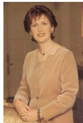
Mary McAleese President of Ireland

I would like to commend all those involved in organising this event and I wish them well with all future endeavours.