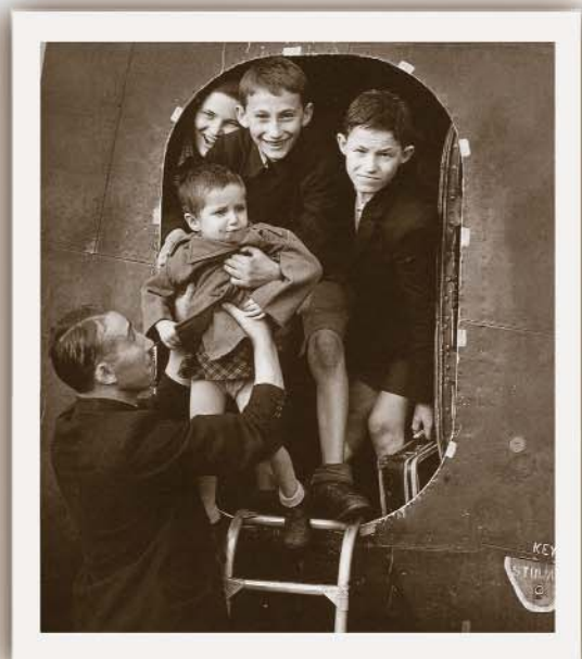
Group of children who survived the concentration camps arriving in Britain in 1945

While by far the greater part of the German people supported the Nazis and turned hostile almost immediately, there were individual exceptions. I had a remarkable escape from death in 1938. Having suffered a serious throat infection (no penicillin in those days) which necessitated admission to hospital, I was asked my religion. I replied, “I am of the Jewish faith.” The sister in charge, a Catholic nun, said to me: “If you want to get out of here alive, you must state that you are Catholic.” She wrote this on my admission form. When the doctor appeared, he was in Nazi uniform. He studied the admission form, believed what was written down, and I was saved. That nun was a Righteous Gentile.