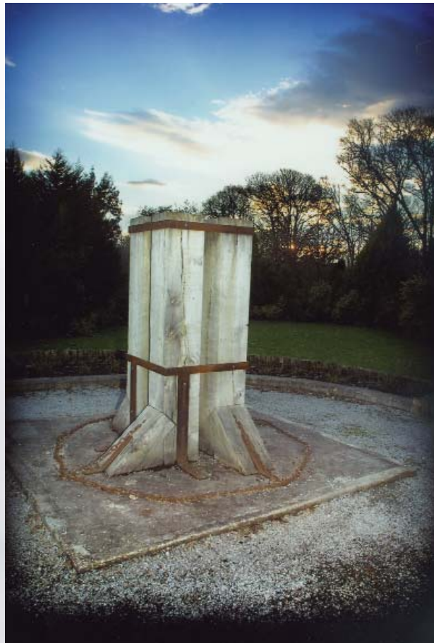
Holocaust Memorial, Garden of Europe, Listowel, Co. Kerry.