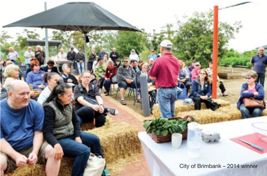
City of Brimbank – 2014 winner