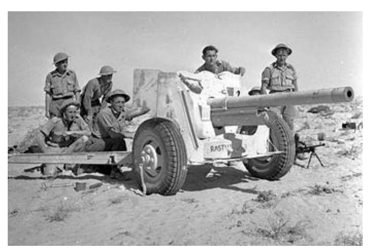
British towed anti-tank gun with crew in North Africa. A well-prepared, dug-in position would lower the gun into defilade, almost flush with the desert floor, making it hard to see and harder to kill.

During World War II, anti-tank missiles and rockets were not yet available. Antitank guns were the weapons that protected non-armoured units. British artillerymen were skilled and brave gunners, but German tacticians employed their guns better. The Germans coordinated all arms, especially anti-tank shields, far more effectively than the British. The German 88mm anti-aircraft cannon, with its family of multi-purpose ammunition, was the most feared tank killer on the North African battlefield.