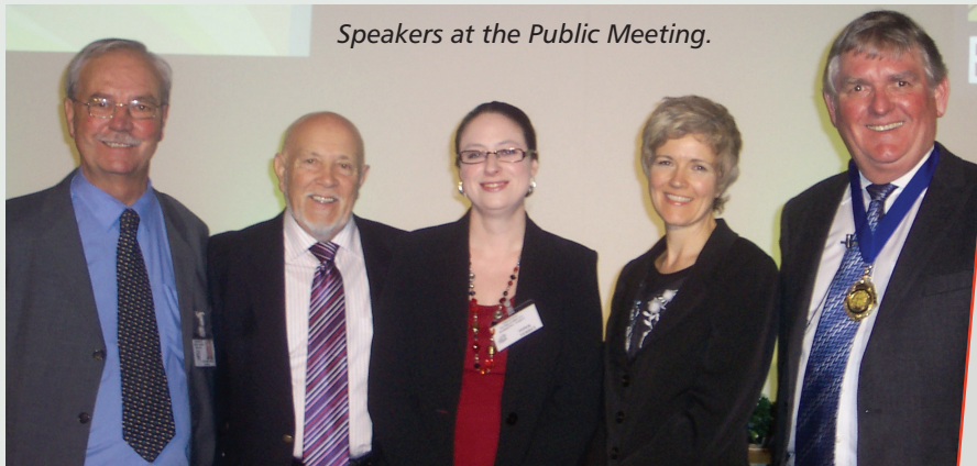
Speakers at the Public Meeting.

For further information and general enquiries contact: Town Clerk • Billericay Town Council • The Loft • Crown Yard • High Street Billericay CM12 9BX