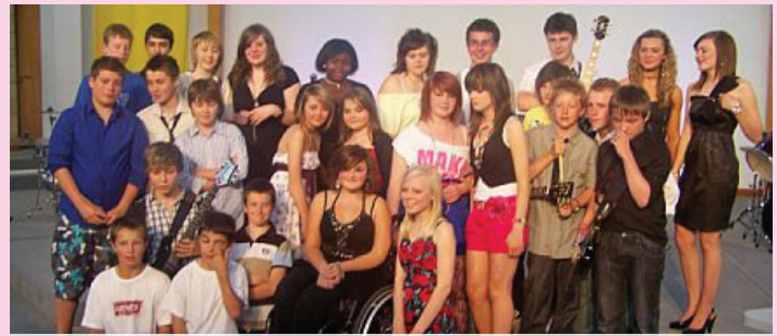
Some of last year's entrants with members of the YTC

The Town Council are grateful to Basildon District Council for allowing this facility to be located within Lake Meadows Park.