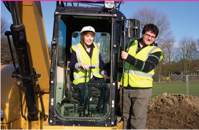
Members of the Youth Town Council help with the installation of the MUSA

Another Talent Contest is to be staged by the BYTC on Saturday 3rd July, 2010 and if you are under eighteen years of age, have talent, live in Billericay and would like to enter the competition, please contact the Town Clerk: 01277 625732 or email: townclerk@billericaytowncouncil.gov.uk.