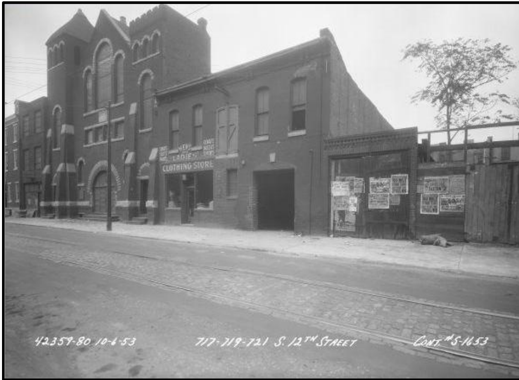
Union Baptist Church in context in 1953.

Located in Hawthorne, a historically African American neighborhood that is bounded by South Street and Washington Avenue to the north and south and by 11 th Street and Broad Street to the east and west, New Hope Temple Baptist Church is now one of three congregations in the neighborhood that occupy purpose-built African American religious buildings built prior to 1950. The other churches, both African American congregations, are Rising Sun Baptist Church and Fitzwater Church of God. Rising Sun Baptist Church is housed in a building that was erected by All Saints Protestant Episcopal Church. 46 Fitzwater Church of God is housed in a building that was first home to Bethesda United Methodist Church. 47 Like Union Baptist Church, All Saints Episcopal Church and Bethesda United Methodist Church remain active congregations (through merged into other congregations and relocated within the city). During Union Baptist Church's tenure at the site, three other houses or served the neighborhood: All Saints Protestant Episcopal Church, Bainbridge Street Methodist Episcopal Church (now Tindley Temple United Methodist Church, and St. Teresa Roman Catholic Church. 48