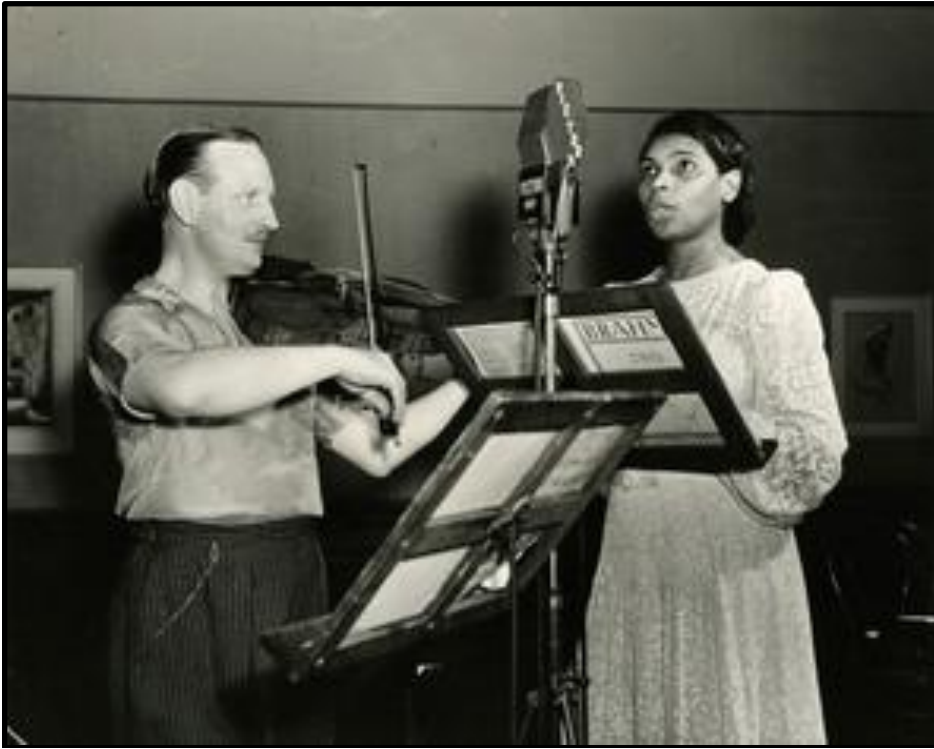
Marian Anderson accompanied by a violinist.

Hall, the White House, the Lincoln Memorial, and the Metropolitan Opera House. She was the first African American individual to do the latter when she starred in Verdi's Un ballo in maschera in 1955. 57