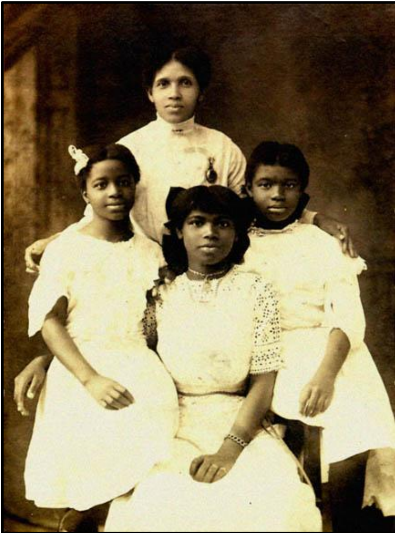
Marian Anderson (center) with her mother and sisters, 1910.

It would be the first performance of many at the Union Baptist Church, then of 709-19 S. 12 th Street.