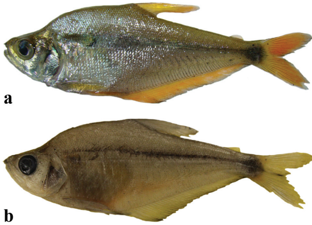
Fig. 2. Photographs of (a) Roeboides bussingi (LSUMZ 14629; 69.2 mm SL) depicting live coloration, and (b) preserved holotype (LSUMZ 14799; 74.9 mm SL).