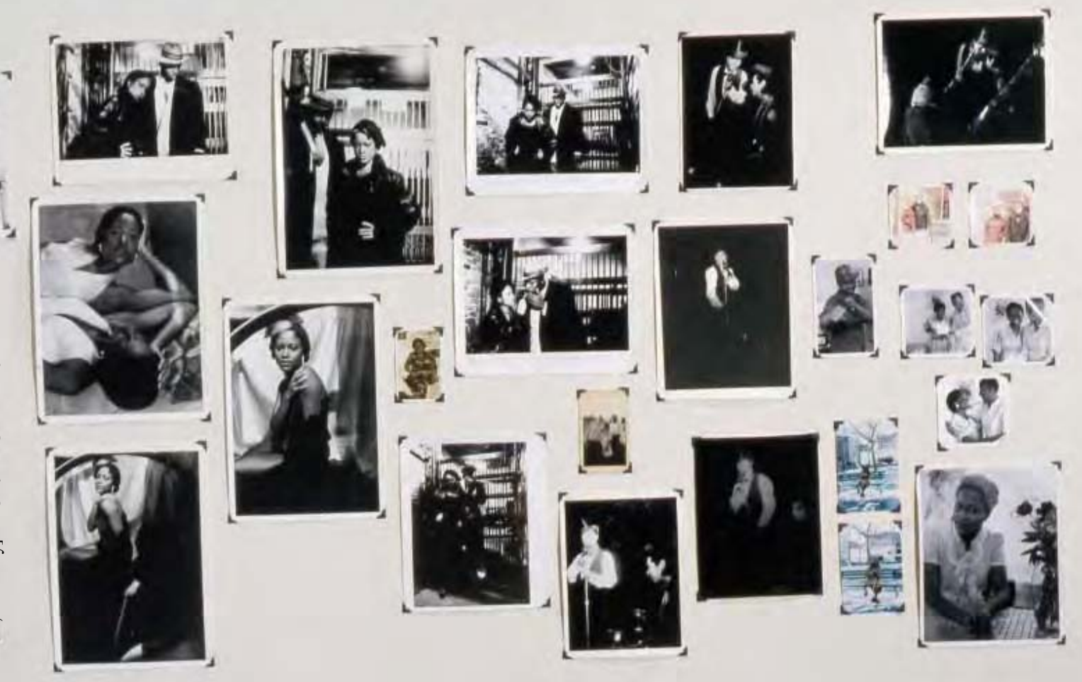
Zoe Leonard, The Fae Richards Photo Archive, 1993–96, gelatin silver prints and chromogenic prints, partial installation view, 1997 Biennial Exhibition, Whitney Museum of American Art, 1997. Whitney Museum of American Art, New York, purchase, with funds from the Contemporary Painting and Sculpture Committee and the Photography Committee 97.51adddd (artwork © Zoe Leonard)

personal life. This is what the "dunyementary" is all about. It is a mixture of the truth and fictions in my life and how they coexist.