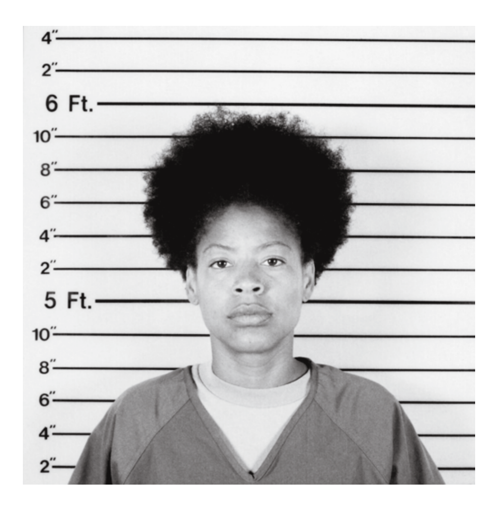
Catherine Opie, Mugshot #1 (Stranger Inside), 2001, Polaroid, 2% x 2% in. (6 x 6 cm) (artwork © Catherine Opie;)

important to me. It revealed the intertwined layers of longing, secrets, and pride inherent in a mother-daughter relationship, which I use in my movie.