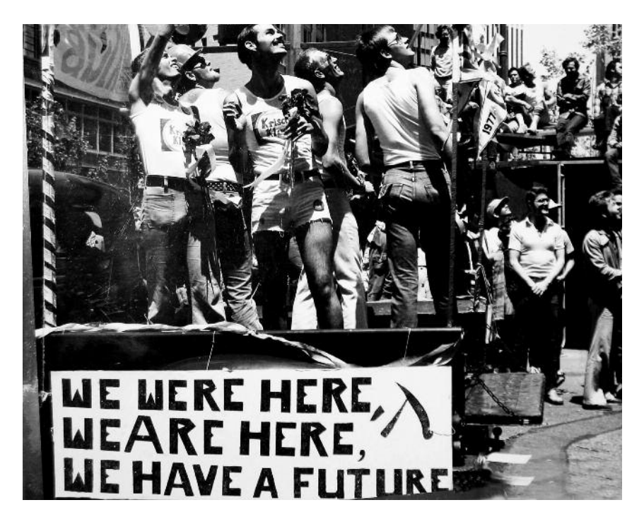
Rink Foto. San Francisco Gay Parade , 1977. Photograph © Rink Foto.

JBW: I think we should wind things down before we get into a frenzy about the election. I want to show you a photograph that seems to encapsulate the issues you persistently deal with and maybe leaves us on a hopeful note: in it, a group of men at a gay rights parade in 1977 are standing in the back of a truck. They are looking up and smiling at something just outside the frame of the photo, almost as if in anticipation of something to come. The banner underneath them reads, "WE WERE HERE, WE ARE HERE, WE HAVE A FUTURE."