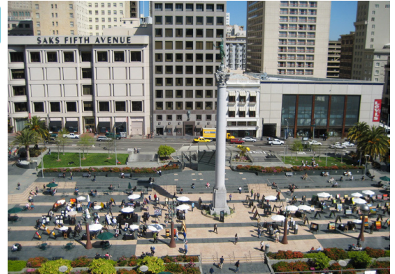
The Central Subway will greatly benefit Union Square.

A short walk through an underground concourse linking the two stations will lead customers directly to the existing Powell Street Station, allowing them to transfer quickly and easily. This concourse-to-concourse connection will make the Union Square/Market Street Station an efficient link to BART and the other Muni Metro lines.