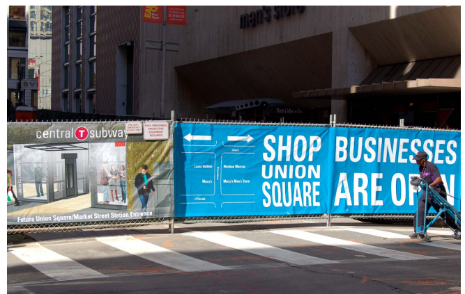
Outside a construction at the future station site.

Station construction is expected to be completed in 2017.