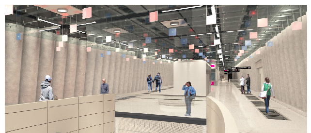
Renderings of Union Square/Market Street Station's exterior, platform and the concourse-to-concourse connection to Powell Street Station.