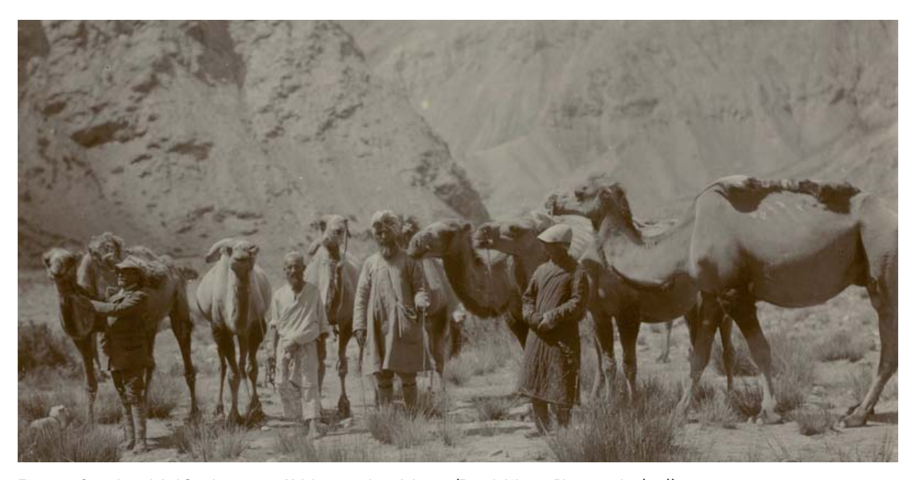
Figure 6 Camels with Lal Singh in centre, Yolchi-moinak, 19 July 1915