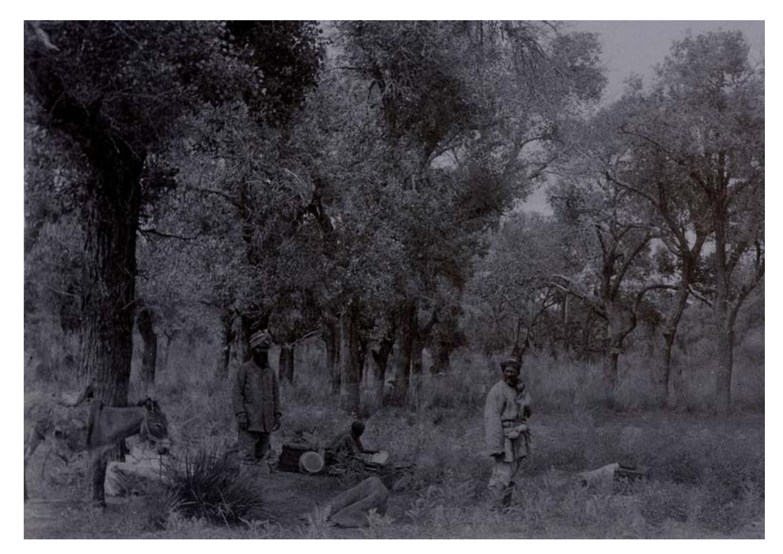
Figure 4 Halt at Buk [Buk-tokhai], Etsingol. Lal Singh] and Isa Bai, 13 June 1914. British Library, Photo 392/28 (530)