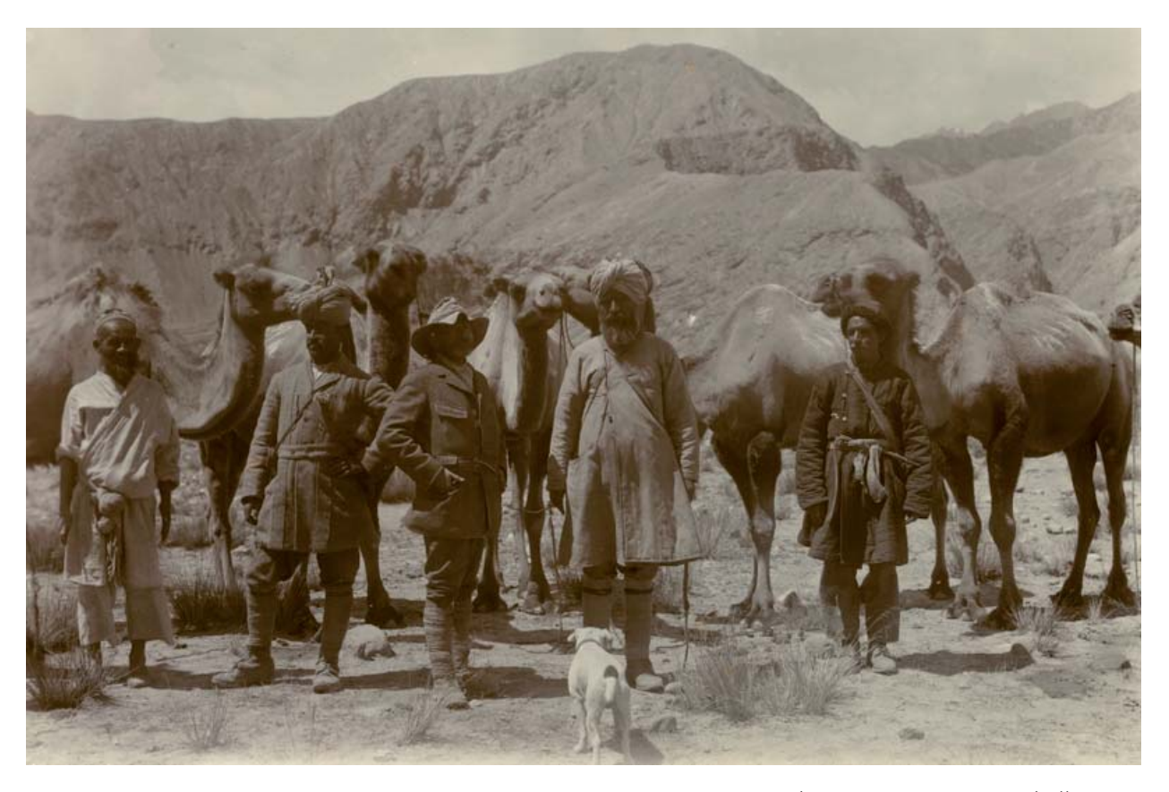
Figure 7 Camels with Afrazgul, Lal Singh, Stein and Jasvant Singh at Yolchi-moinak, 19 July 1915