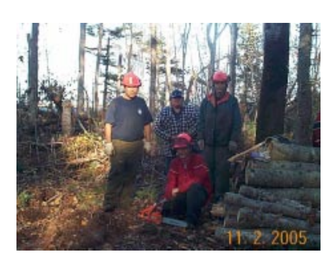
Local Band members work on the Eco-Trail

included in the streetscape in order to highlight the culture and heritage of the community.