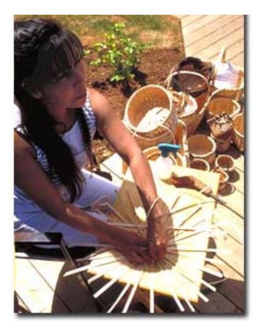
Craft-making is integrated into the Eco-Tourism development strategy.

Whatever the activity, a high priority is placed on having band members involved in the developments.