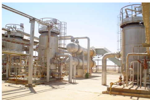
Afghanistan's main energy resource is natural gas.

Notably, Afghanistan also has some 1.5 million tons of barytes, an industrial mineral used as a weighting agent in the manufacture of oil well drilling. This deposit will play a strong support role in the development of the hydrocarbons industry in Afghanistan and other Central Asian countries.