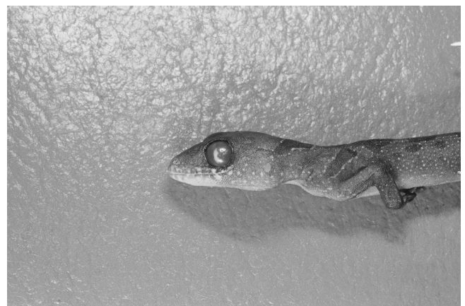
Fig. 1. Cyrtodactylus buchardi , new species. Holotype (MNHN2003.3301). Lateral view of the head (left side).

Habitus. ♂ Juvenile male; SVL: 33.35 mm; Trunk L: 14.30 mm; TaL: 30.85 mm; TL: 64.20 mm; HL: 9.75 mm; HW: