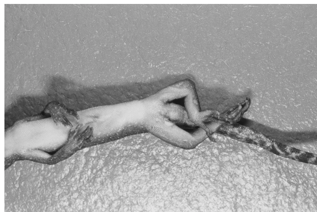
Fig. 4. Cyrtodactylus buchardi , new species. Holotype (MNHN2003.3301). Ventral view.