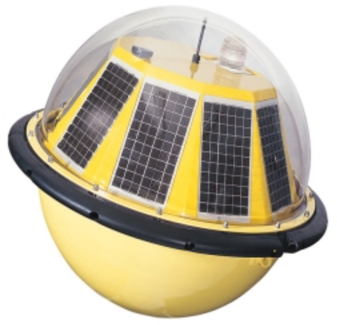
TRIAXYS<sup>™</sup> Directional Wave Buoy

The custom GEDAP program produces time series records defining displacement, velocity and acceleration for each of the actual buoy motions (roll, pitch, yaw, surge, sway and heave). Another program, MOTSYN4,