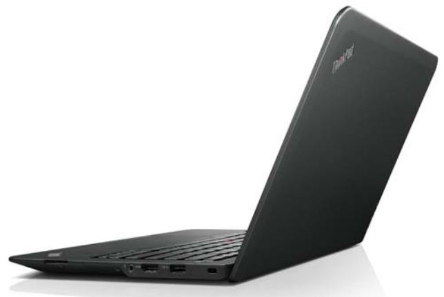
Lenovo® ThinkPad S3-S431