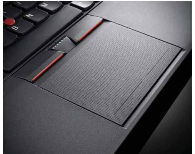
Lenovo ThinkPad Edge E545