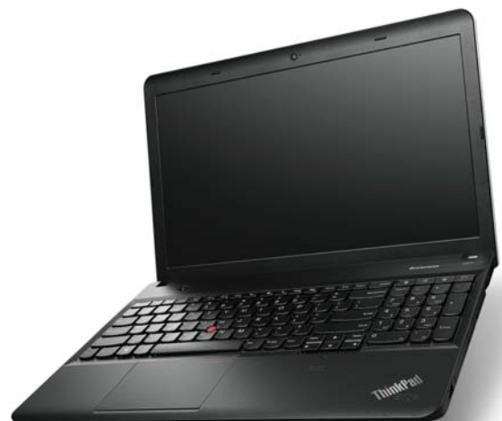
Lenovo ThinkPad Edge E531 with Numeric Keypad