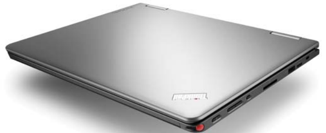
Lenovo ThinkPad S1 Yoga