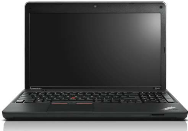
Lenovo® ThinkPad Edge E545