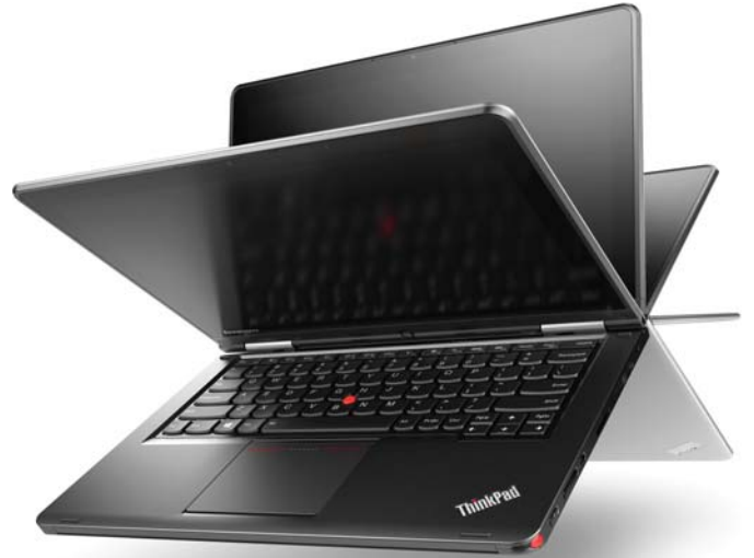
Lenovo ThinkPad S1 Yoga