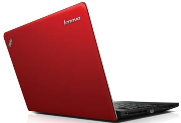
Lenovo ThinkPad Edge E540