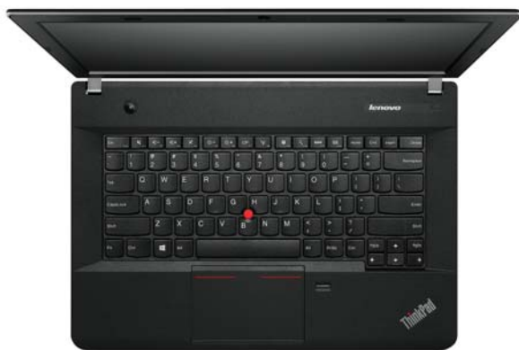
Lenovo ThinkPad Edge E440