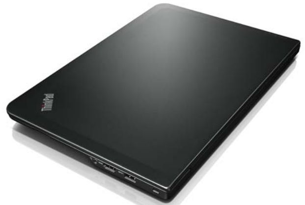
Lenovo® ThinkPad S3-S431