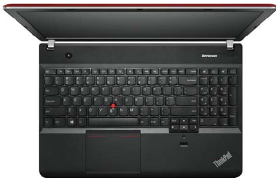
Lenovo ThinkPad Edge E540 with Numeric Keypad