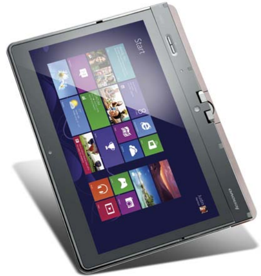
Lenovo® ThinkPad Twist S230u (Tablet Mode)