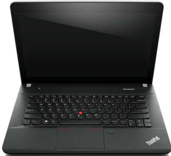
Lenovo® ThinkPad Edge E440 with MultiTouch Screen