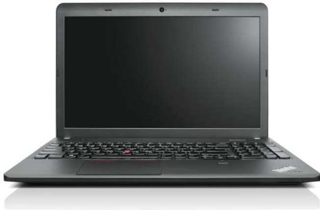
Lenovo® ThinkPad Edge E540