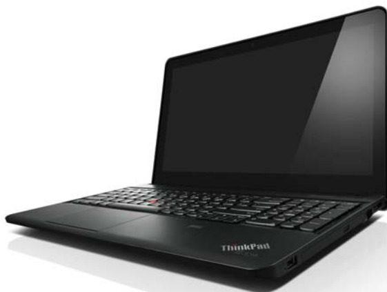
Lenovo ThinkPad Edge E540 with Touch Screen