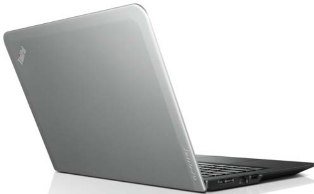
Lenovo® ThinkPad S3-S431