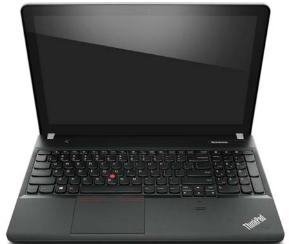
Lenovo ThinkPad Edge E540 with Touch Screen