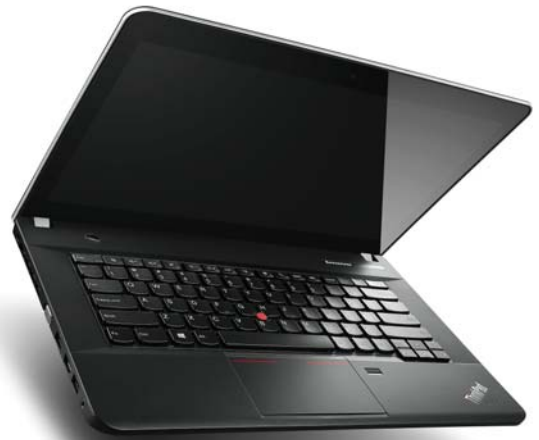
Lenovo ThinkPad Edge E440 with MultiTouch Screen