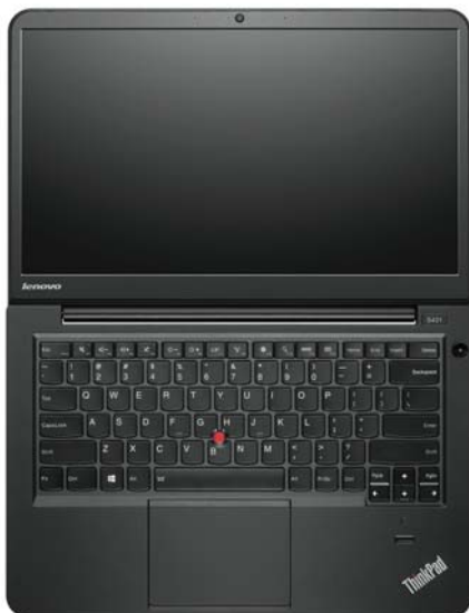
Lenovo® ThinkPad S3-S431