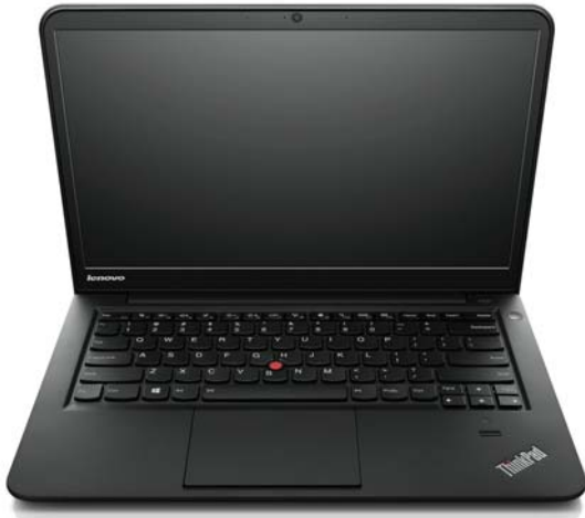
Lenovo® ThinkPad S3-S431