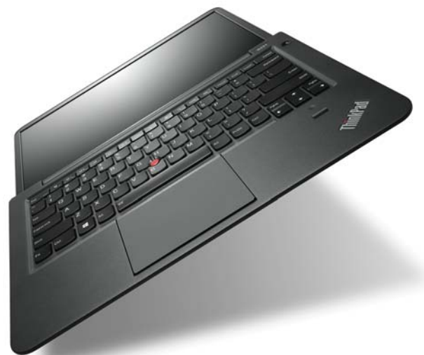
Lenovo® ThinkPad S3-S431