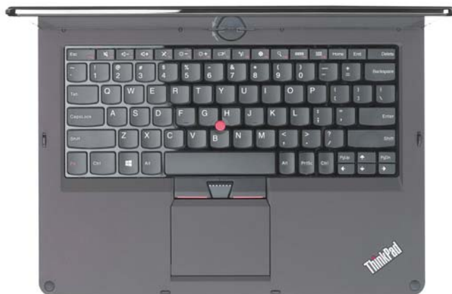
Lenovo® ThinkPad Twist S230u