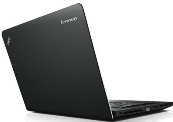
Lenovo ThinkPad Edge E440