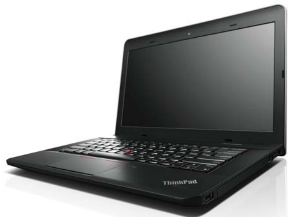
Lenovo ThinkPad Edge E440