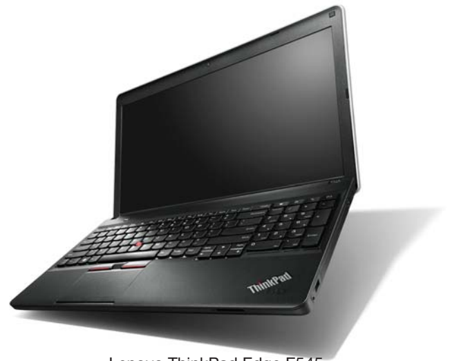
Lenovo ThinkPad Edge E545