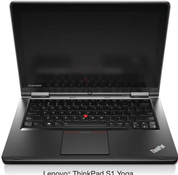
Lenovo® ThinkPad S1 Yoga