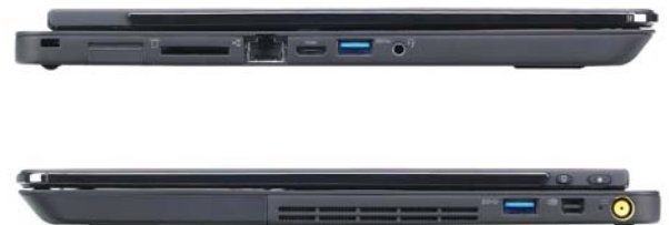
Lenovo® ThinkPad Twist S230u