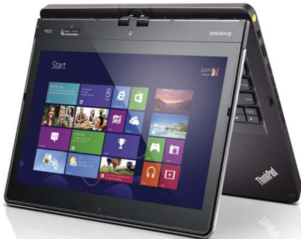
Lenovo® ThinkPad Twist S230u (Tent Mode)