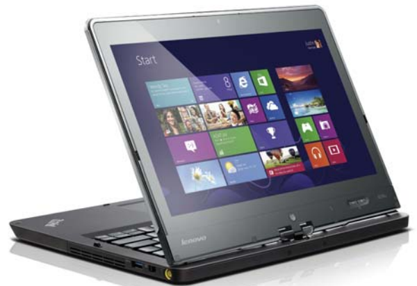
Lenovo® ThinkPad Twist S230u (Stand Mode)