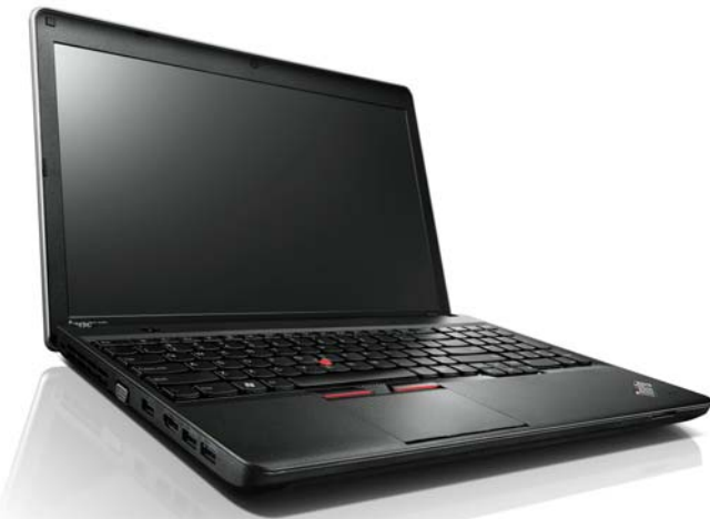
Lenovo ThinkPad Edge E545