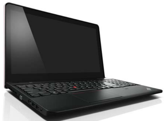
Lenovo ThinkPad Edge E540 with Touch Screen