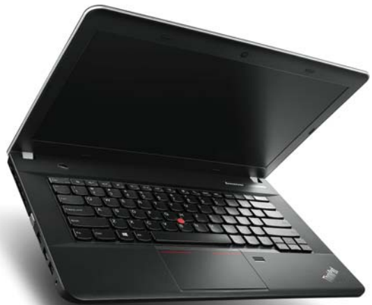
Lenovo ThinkPad Edge E431