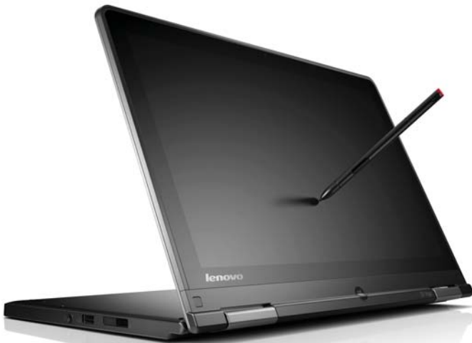
Lenovo ThinkPad S1 Yoga