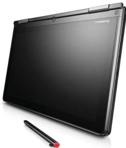
Lenovo ThinkPad S1 Yoga