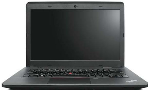
Lenovo ThinkPad Edge E431