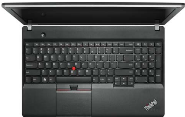
Lenovo ThinkPad Edge E545