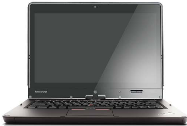
Lenovo® ThinkPad Twist S230u (Notebook Mode)