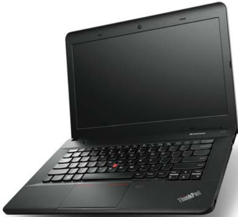
Lenovo® ThinkPad Edge E431