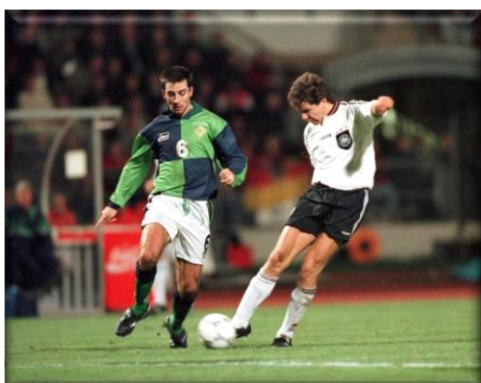
FIFA World Cup Preliminary Competition 1998: Germany – Northern Ireland 1:1; Kevin HORLOCK (NIR – left), Andreas MOELLER (GER – right)

Northern Ireland have recorded more 0-0 draws than any other European side in the history of the preliminary tournament, 15 in total.