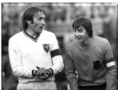
FIFA World Cup Preliminary Competition 1974: Netherlands - Belgium 0:0, Team captains: Paul VAN HIMST (BEL, left) and Johan CRUYFF (NED, right)

* Played in inaugural FWC in 1930 (no preliminary competition). Withdrew from the 1950 qualifiers without playing a single match. Having been eliminated in the 1958 preliminary competition, Belgium declined a second chance to qualify by playing Israel.